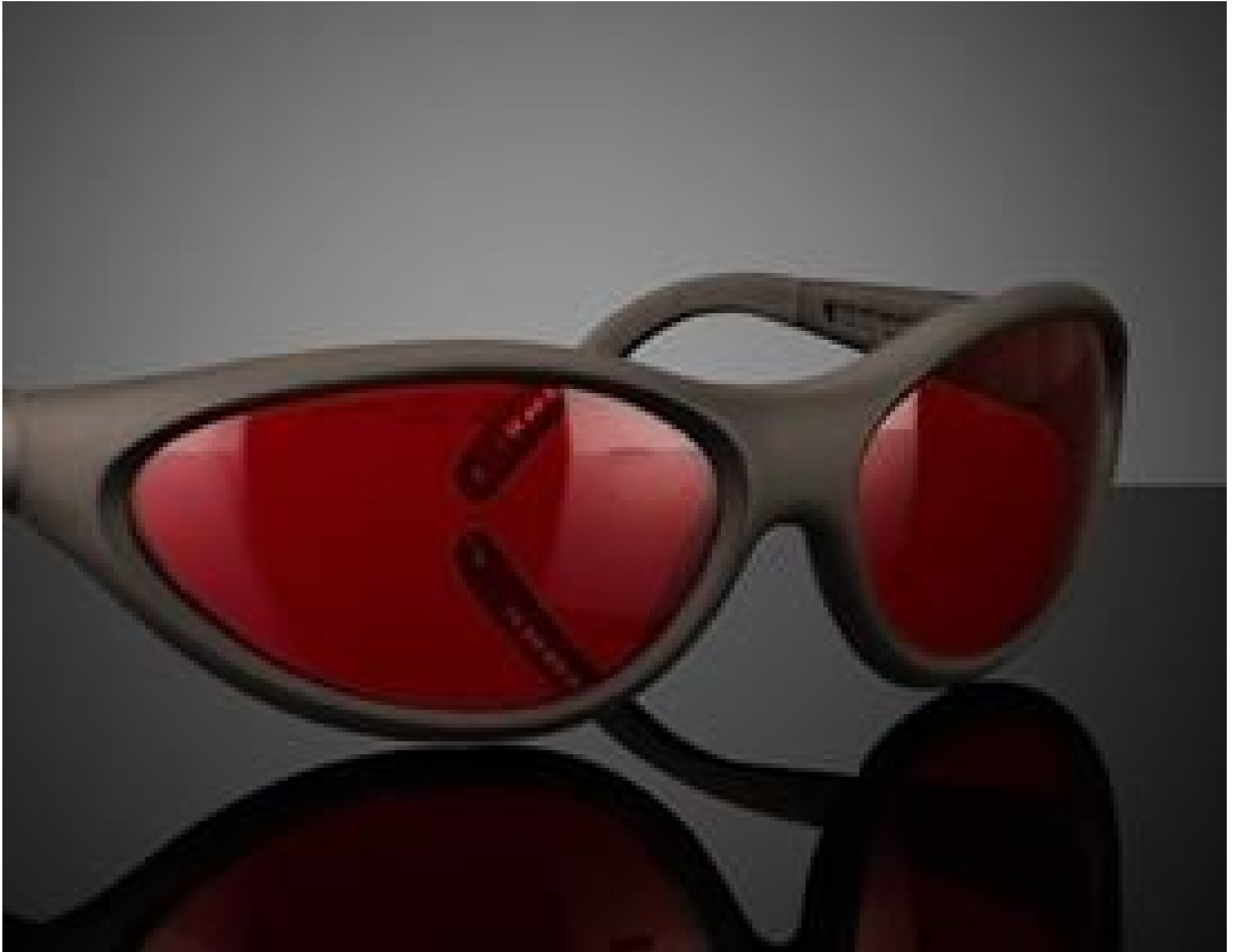
Image represents frame style only. Filter color will vary by product specification.