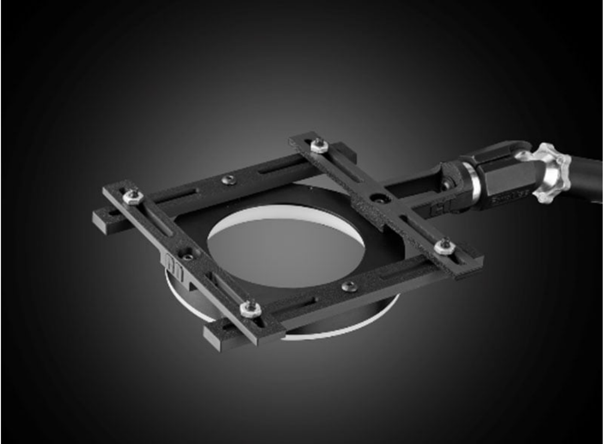
Ring Light Configuration