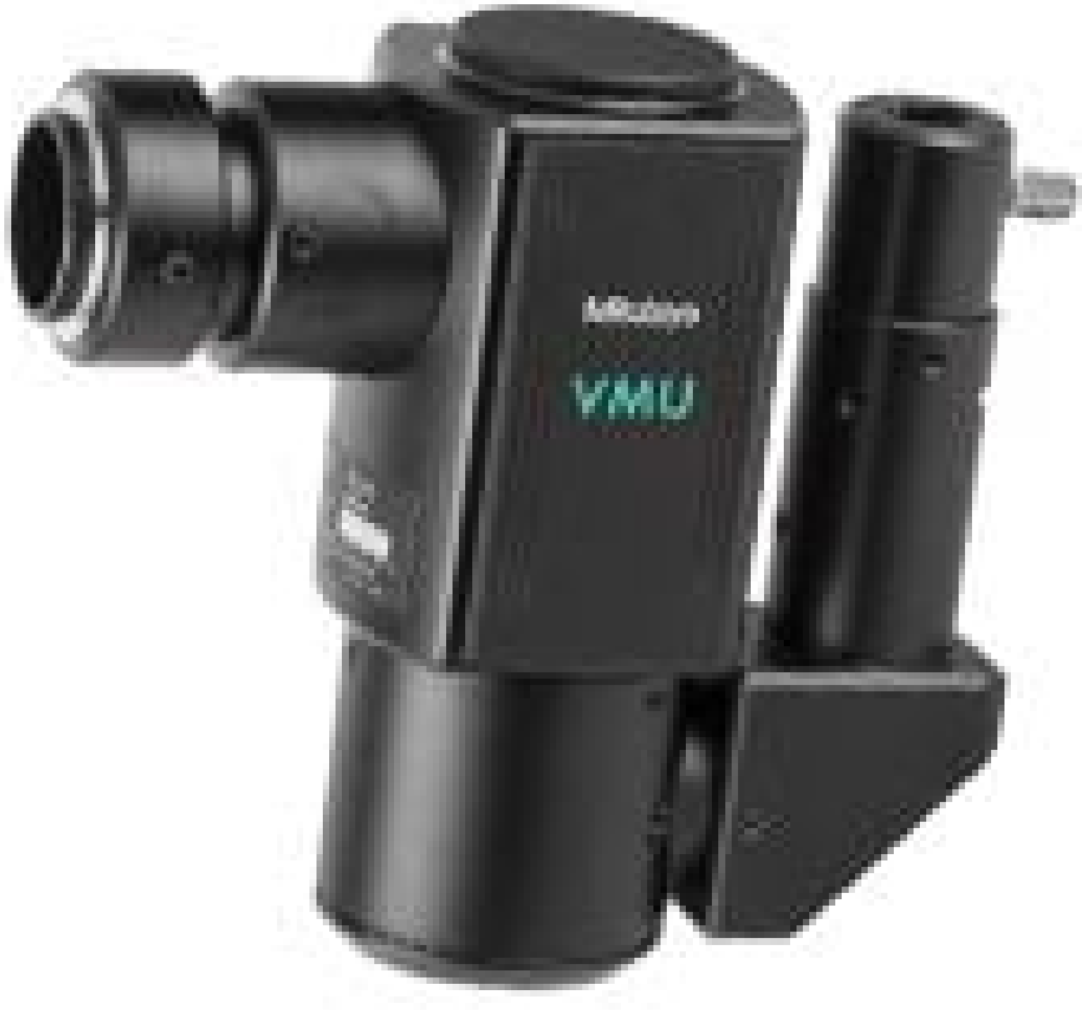
VIS-NIR Horizontal Mitutoyo Video Microscope Unit, #89-621