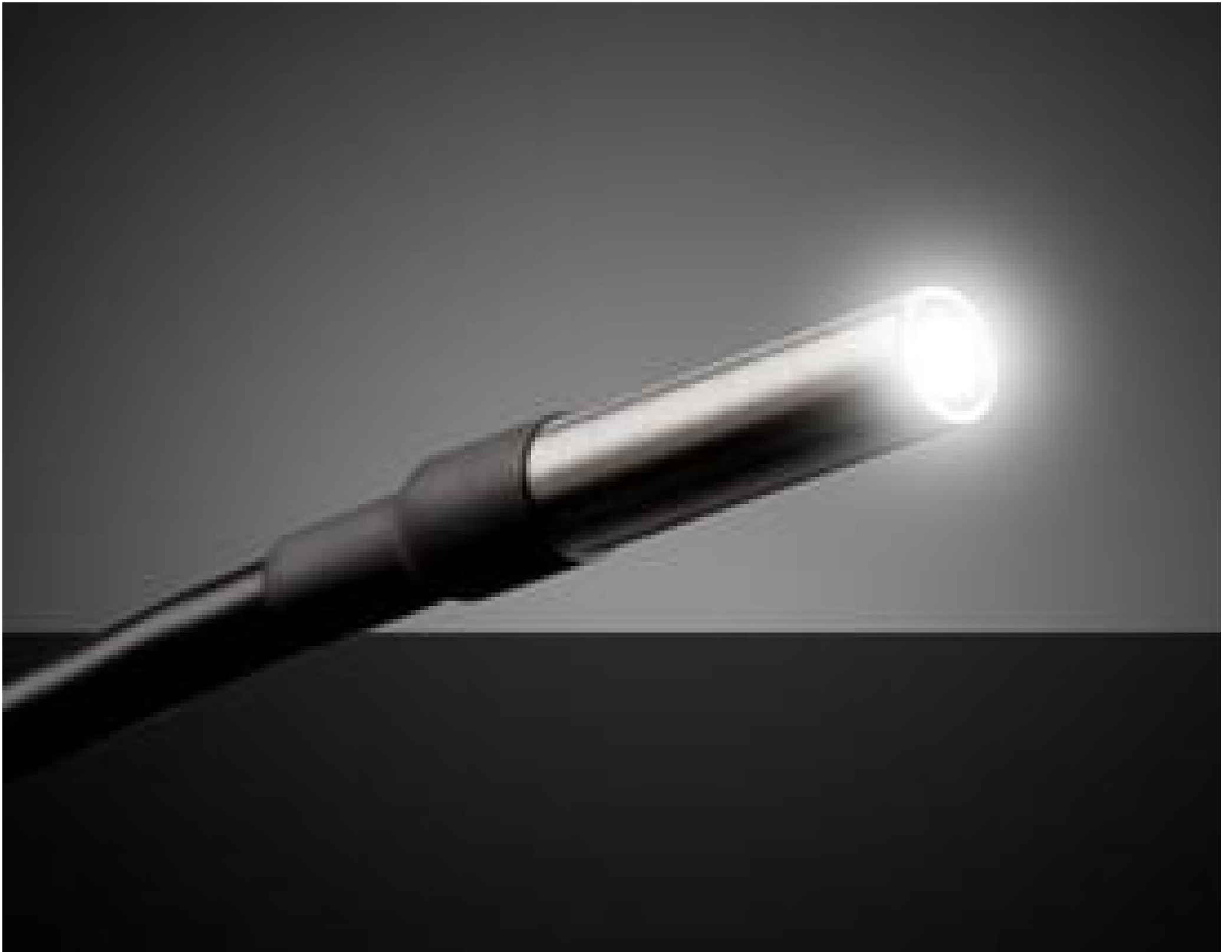
Advanced Illumination MicroBrite Spot Light