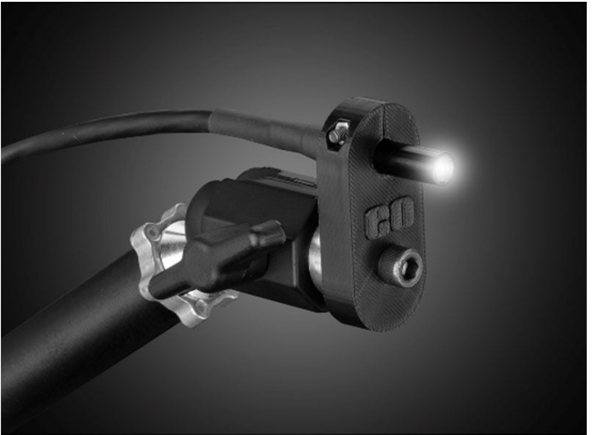
Spot Light Configuration