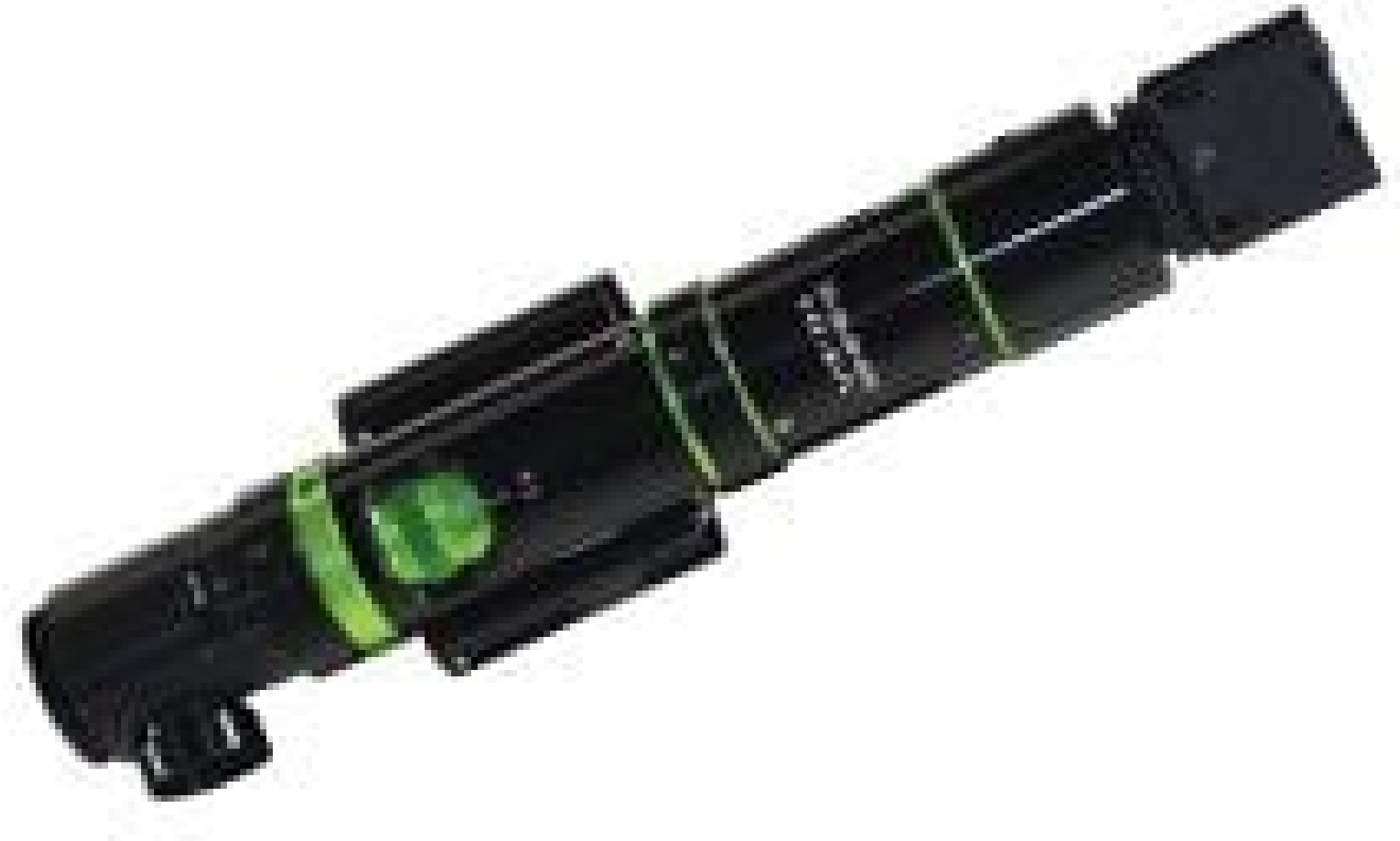
Photo represents a complete Zoom Lens. For individual component line art, see the Technical Information tab.