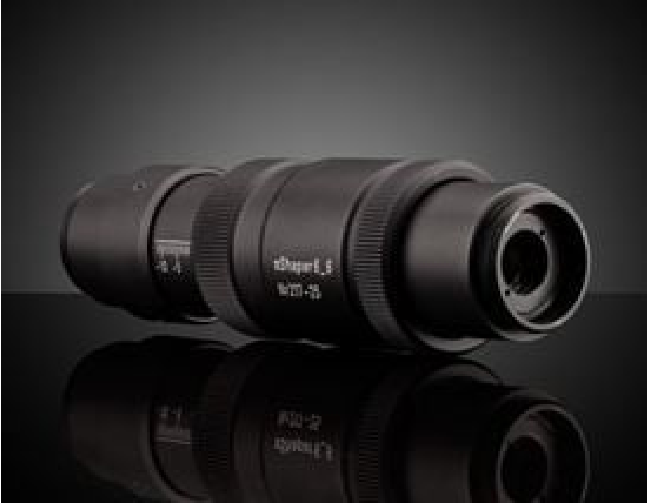
Ti:Sapphire Flat Top Beam Shaper, #36-649