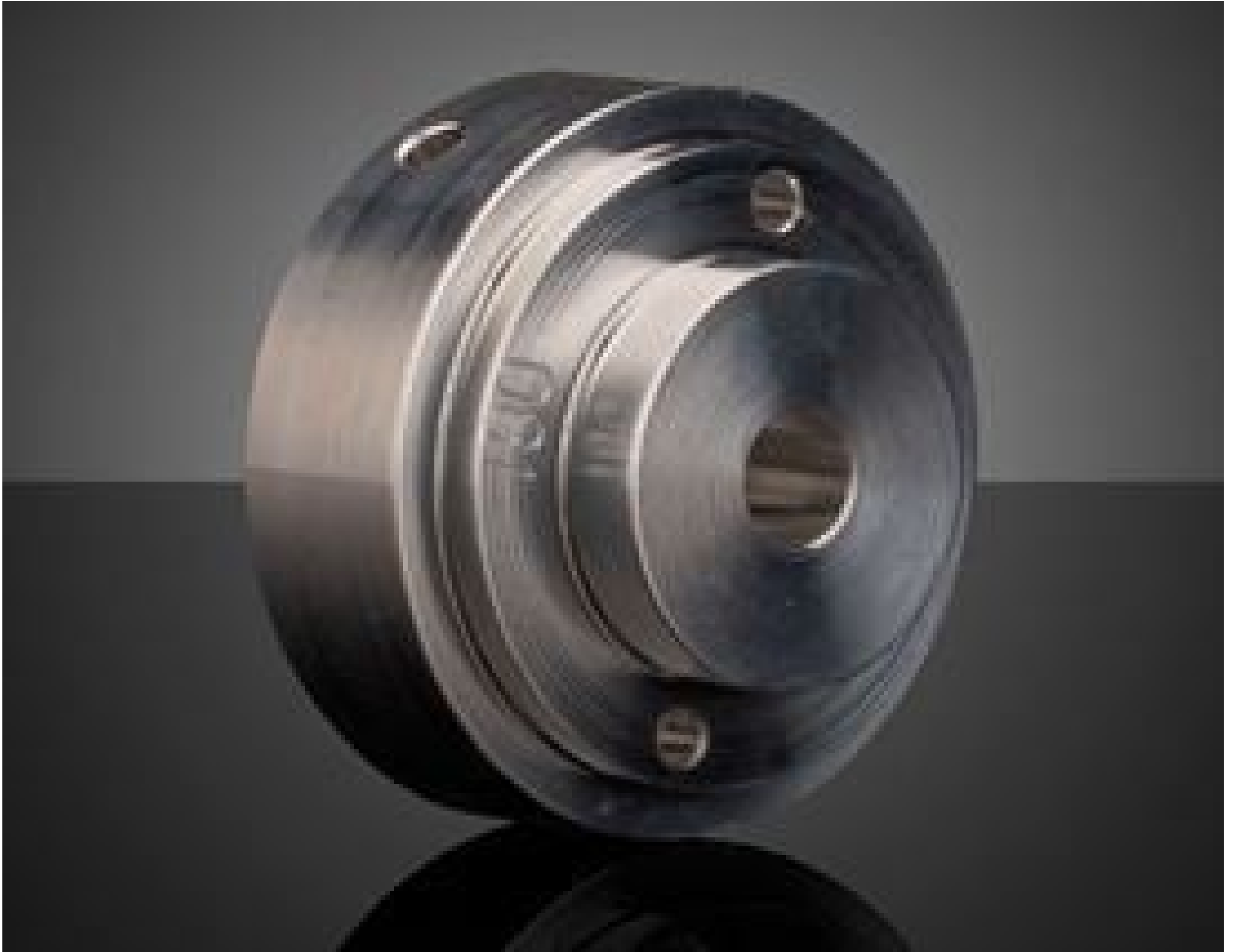
SugarCUBE™ Light Guide Adapter - 3mm (#13-536)