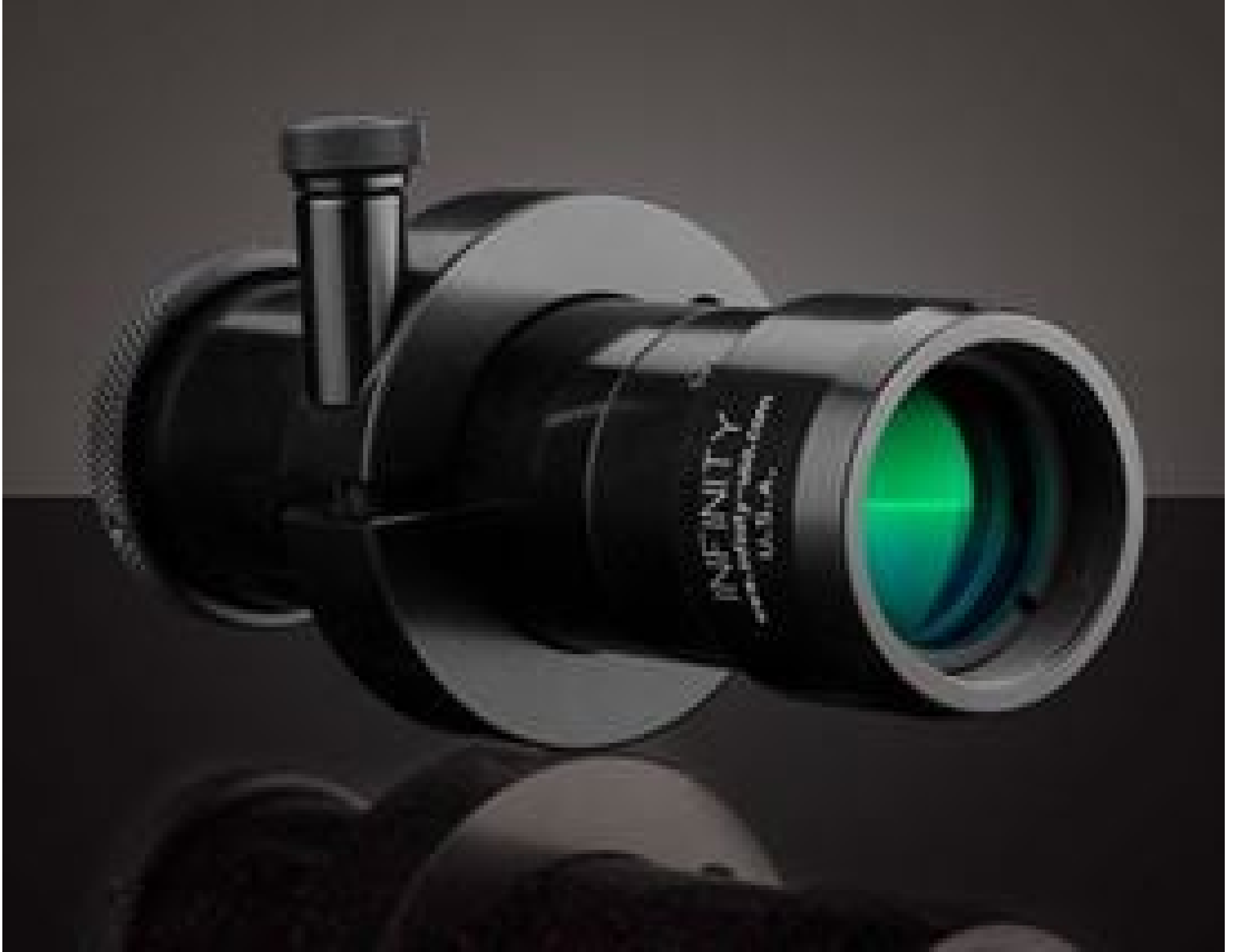
Standard (with no In-Line Attachment), InfiniTube, #56-125

See More by Infinity Photo-Optical Company