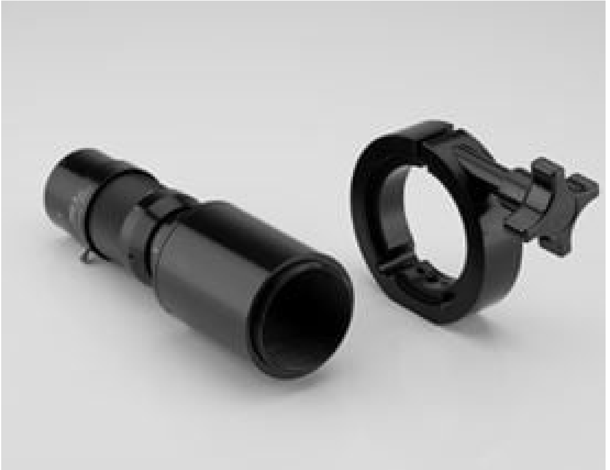
#86-890: ST Main Body with Iris, T-Mount, KC VideoMax