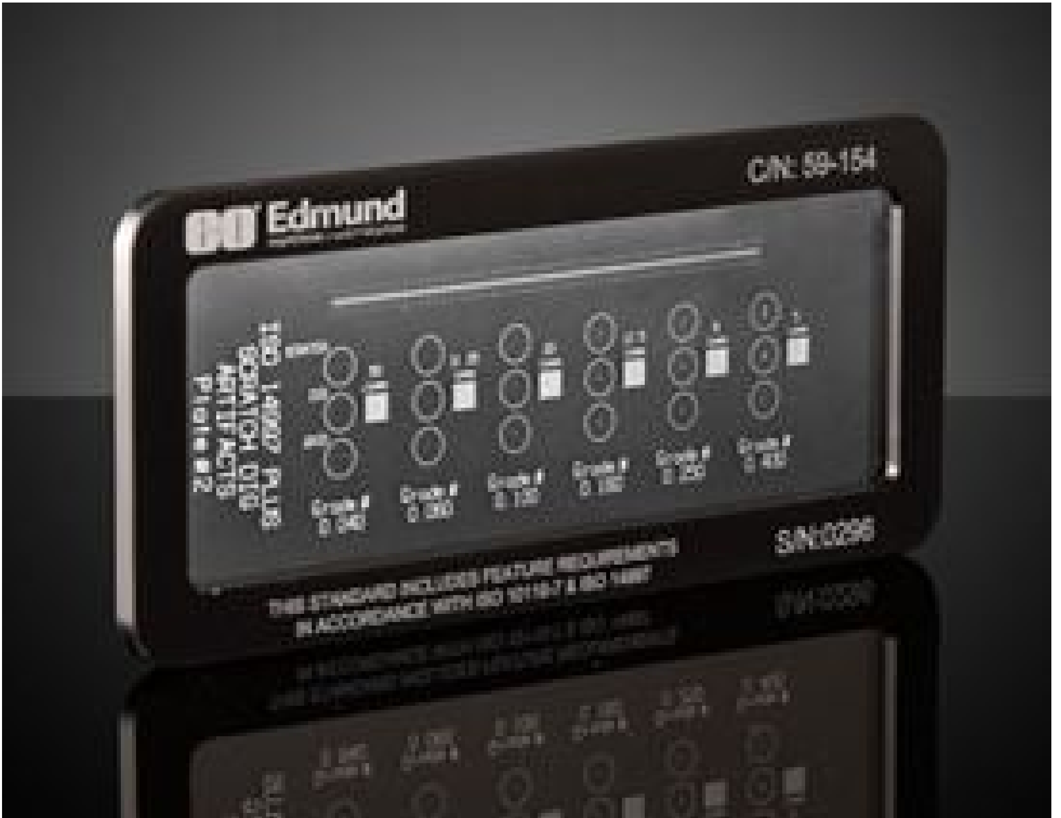
Scratch & Dig Target (1st Surface Positive), #59-154