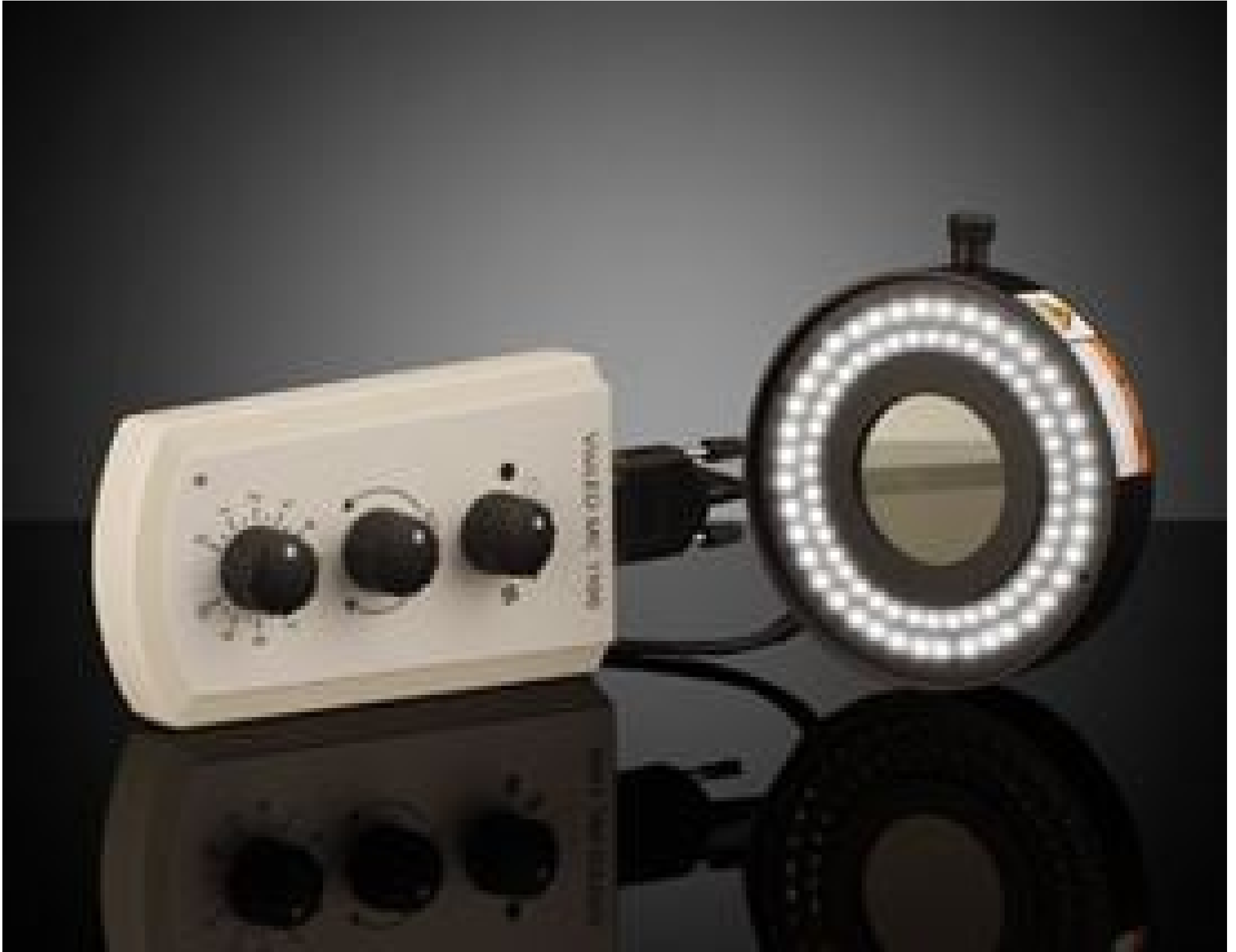
Ring light, controller & power supply required and sold separately.