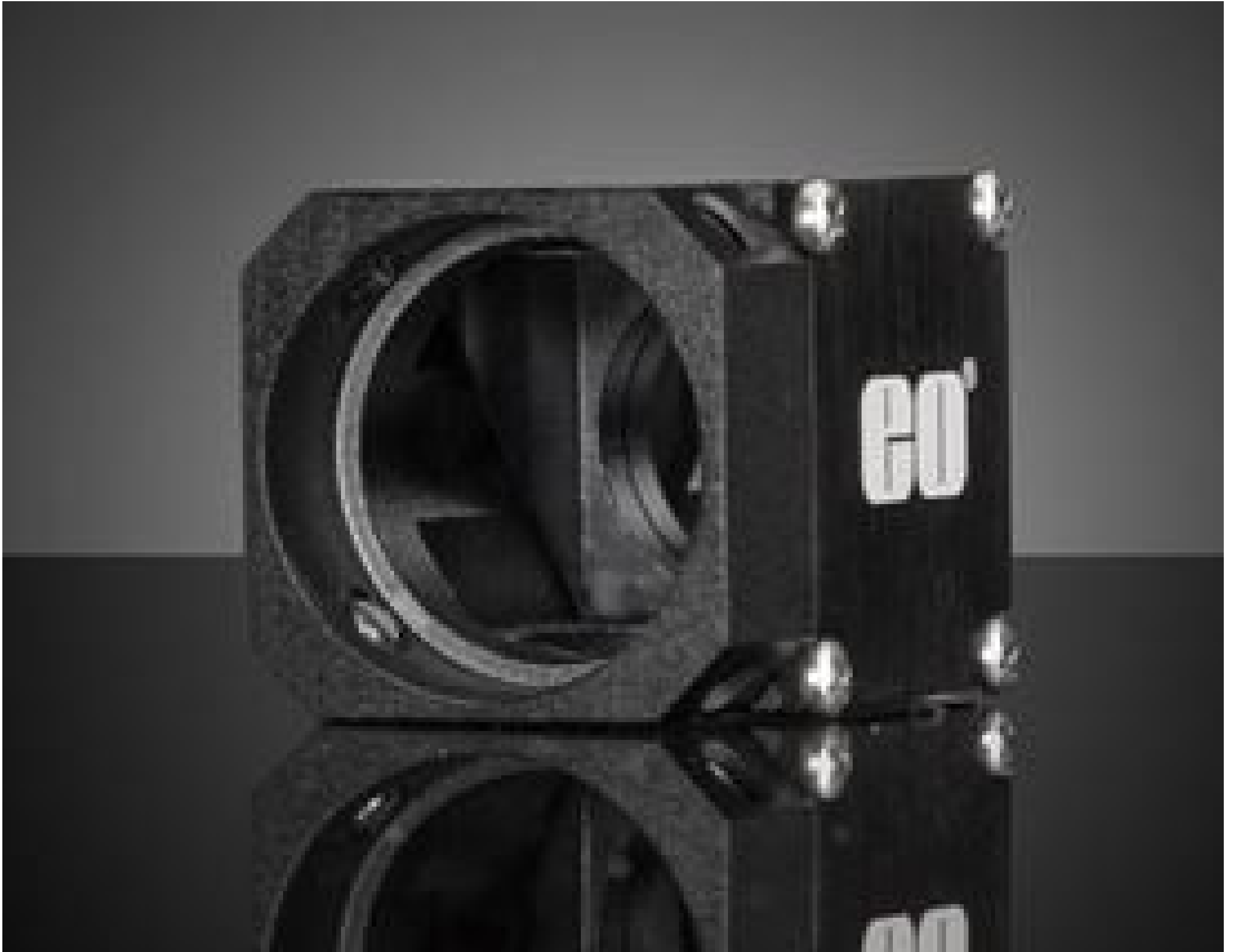
Right Angle Adapter For 18mm Dia. Lenses, #88-215