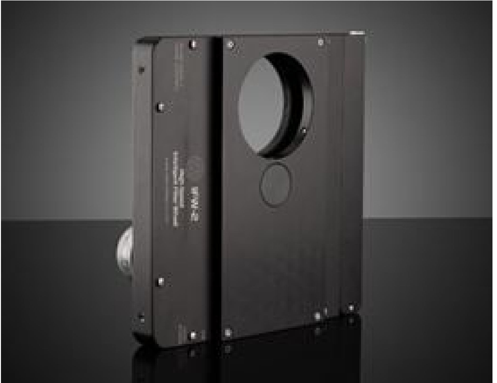
Motorized Filter Wheels