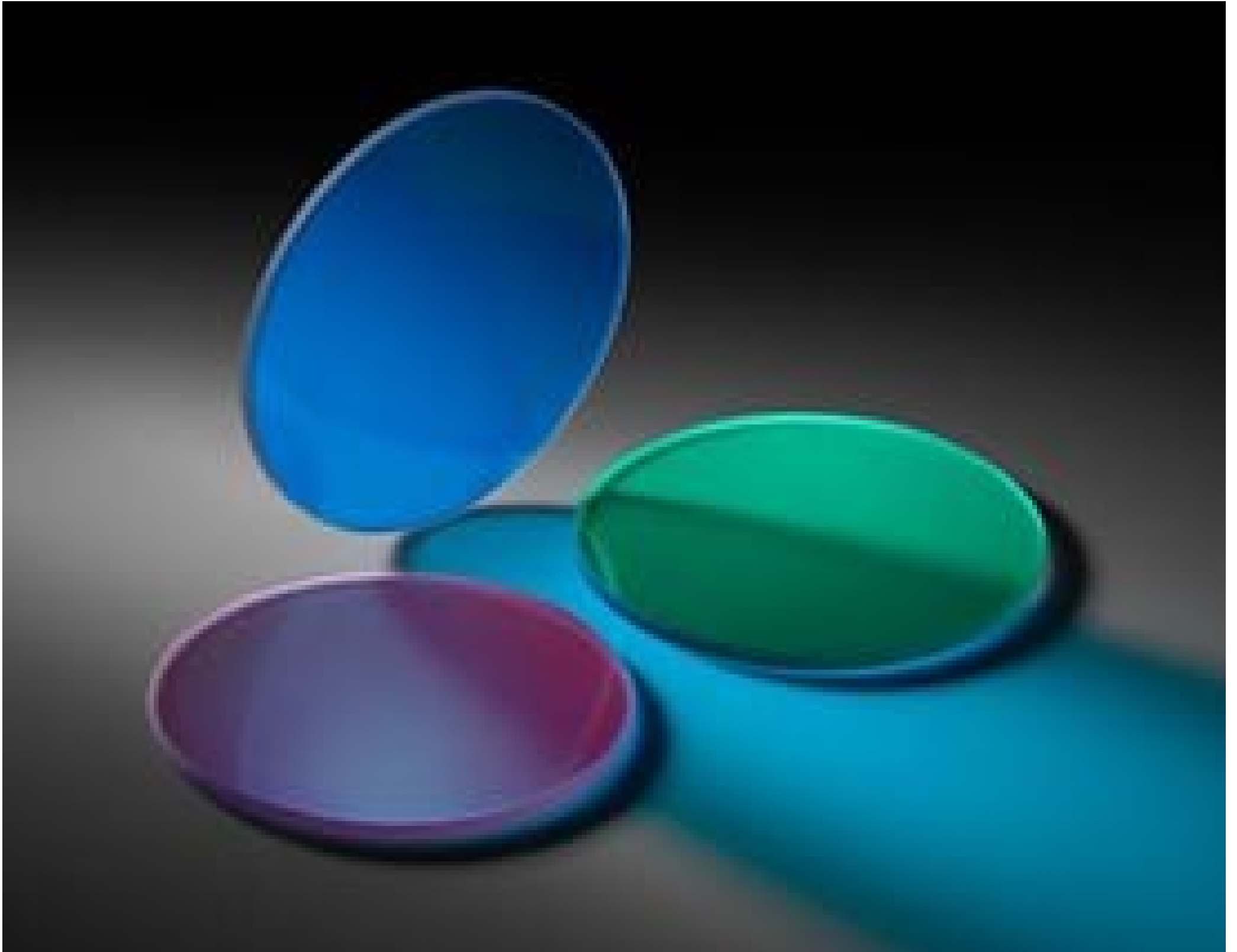
Red, Green, and Blue Dichroic Filter Set