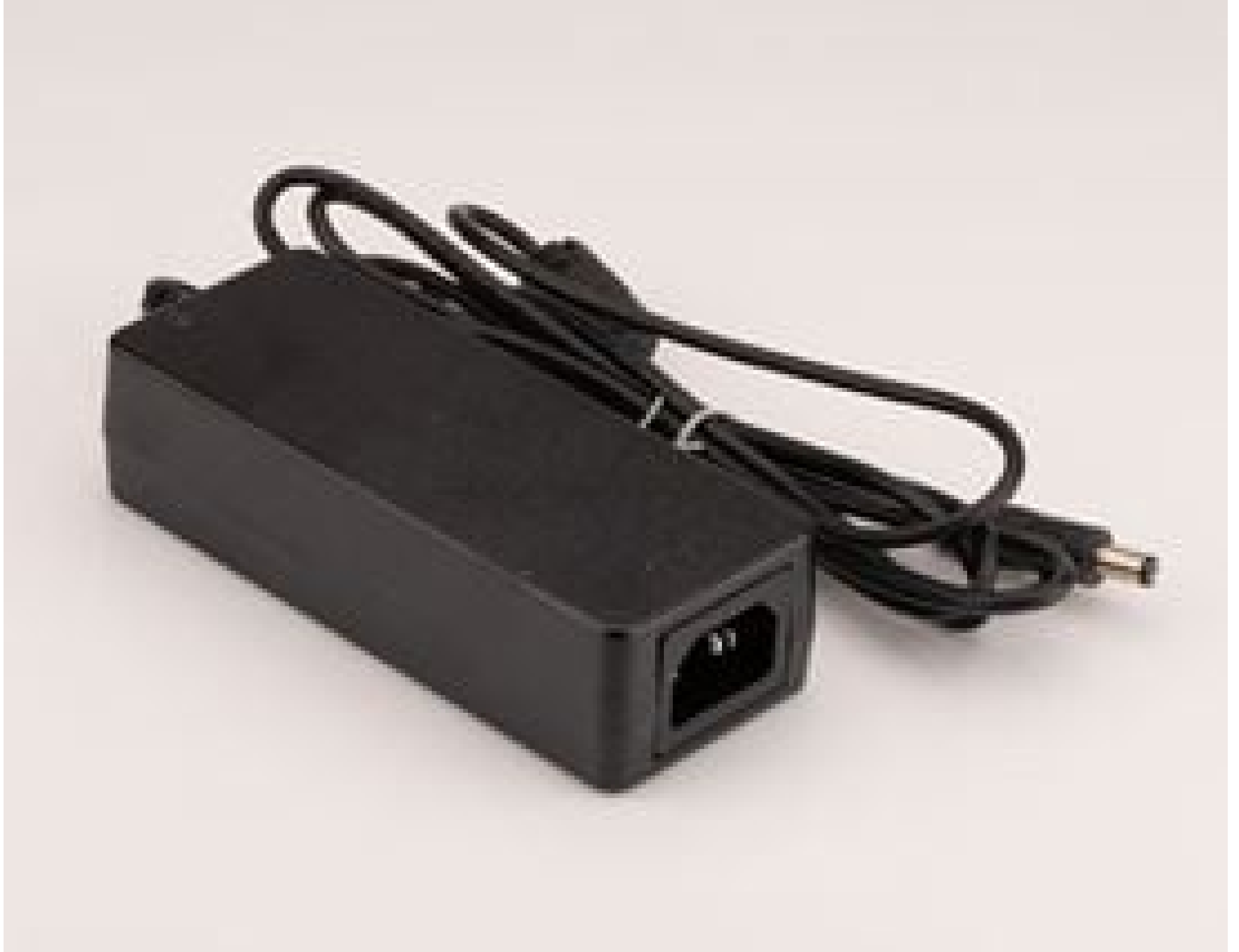
#16-791: Power Supply for SCHOTT VisiLED Ringlights