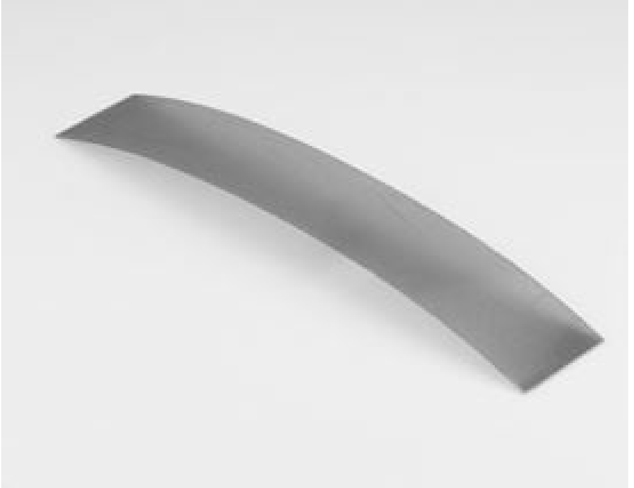
#34-884: Polarizer Accessory for 10 LED Bar Light