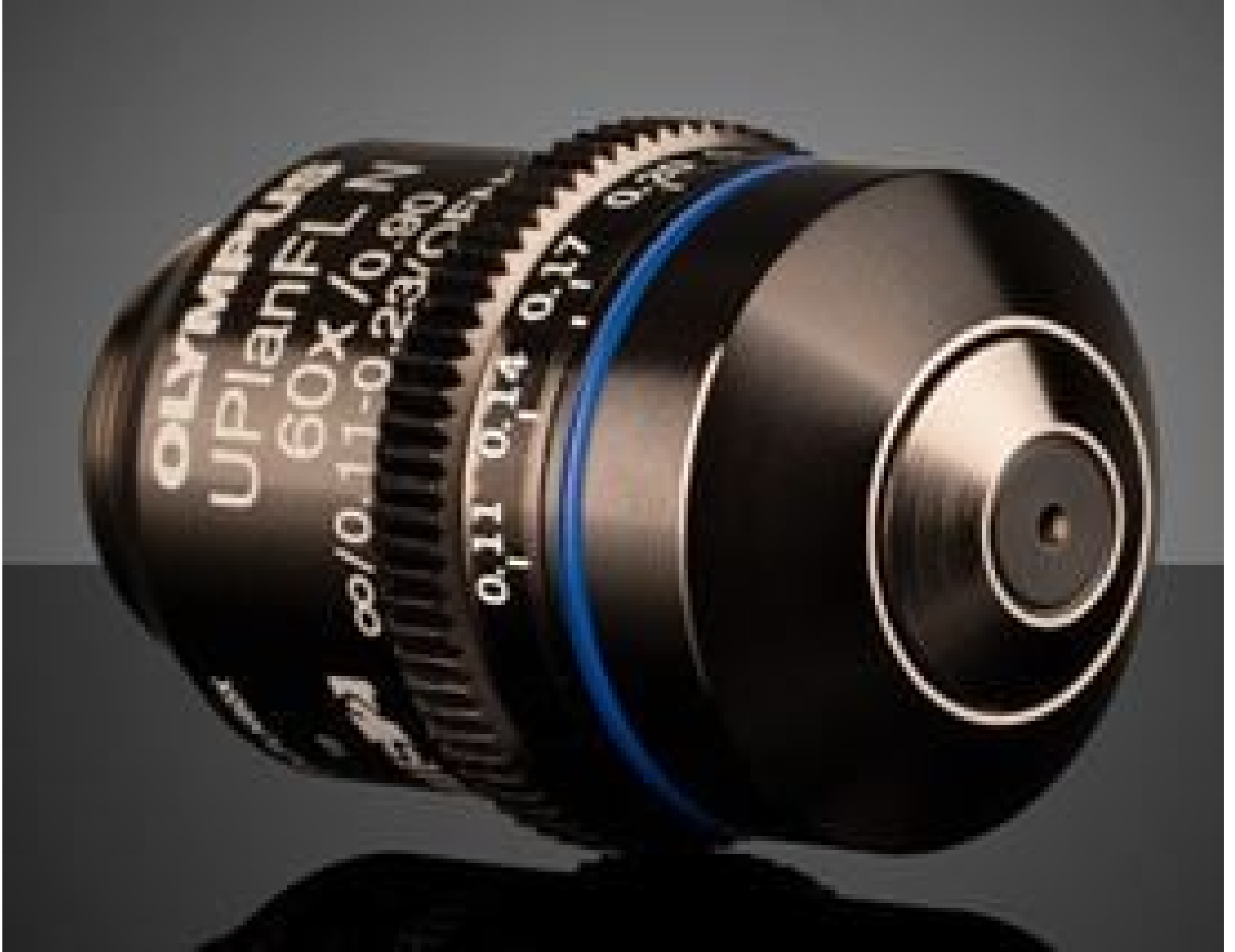
Olympus UPLFLN 60X Objective