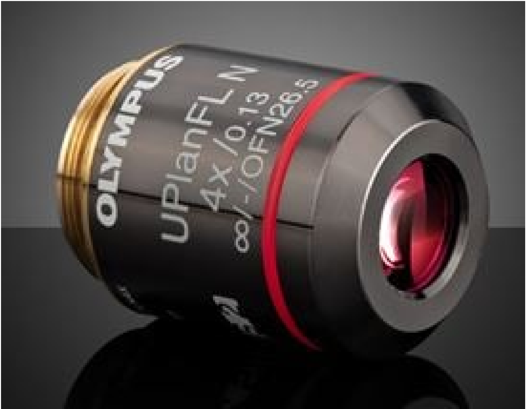
Olympus UPLFLN 4X Objective