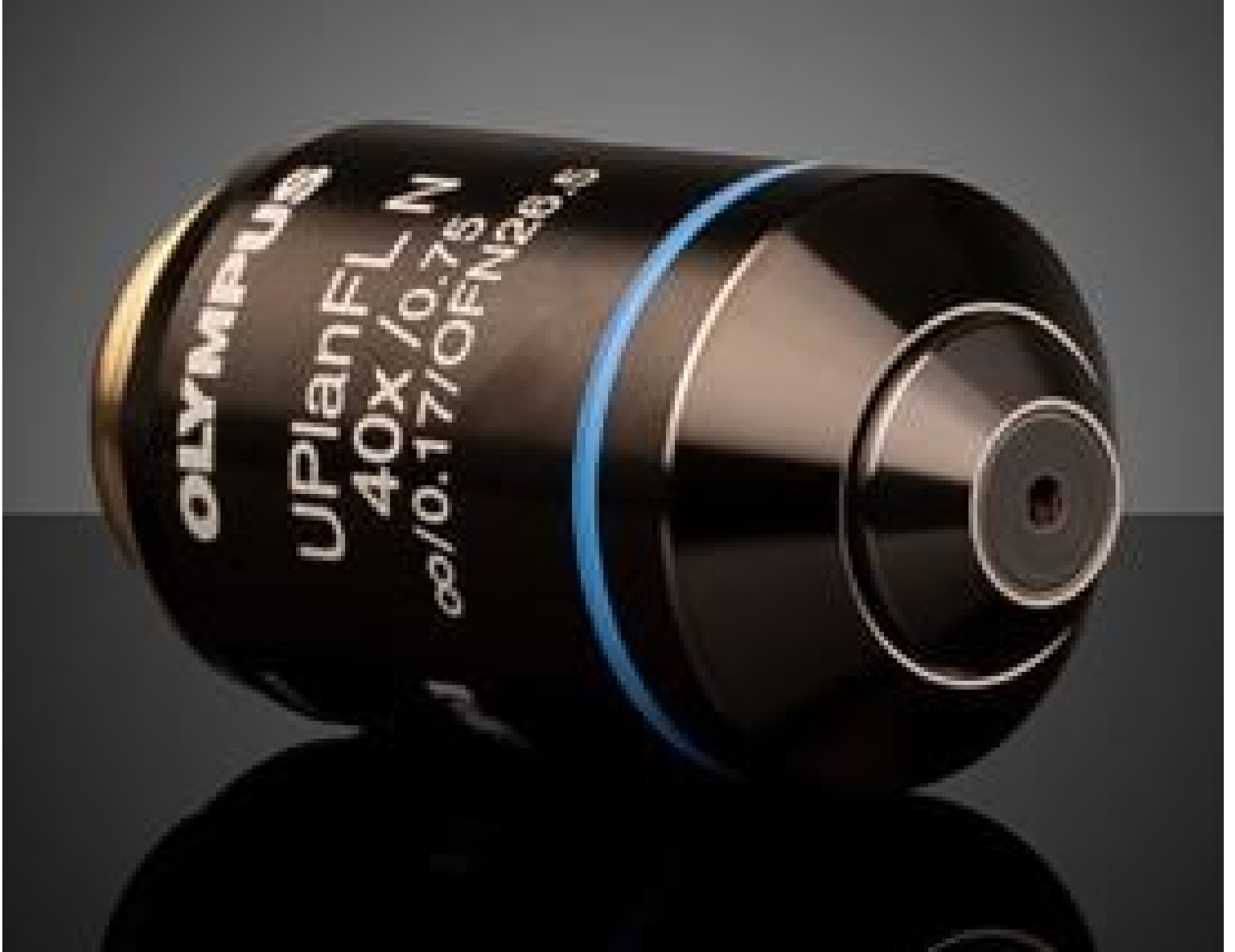
Olympus UPLFLN 40X Objective