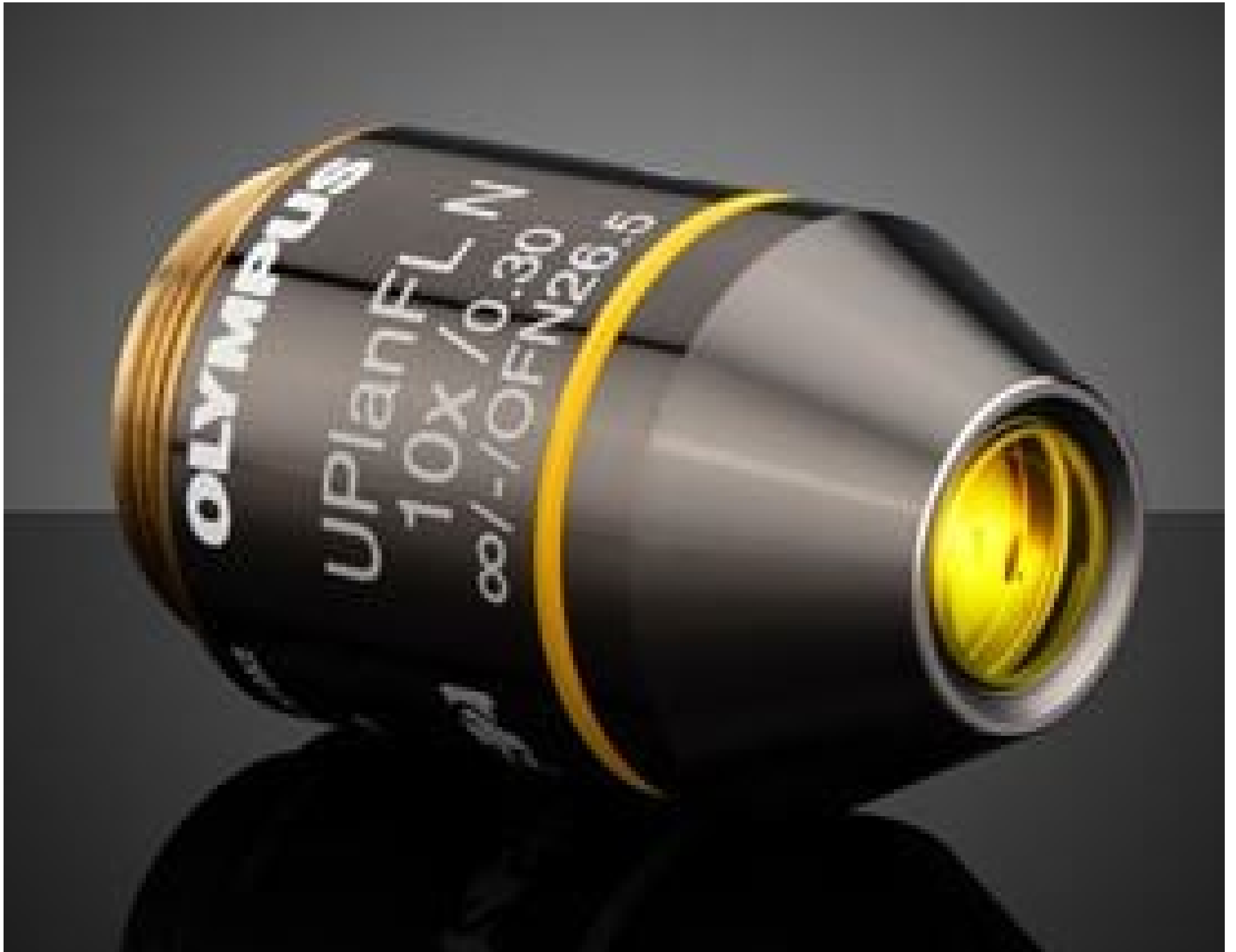
Olympus UPLFLN 10X2 Objective