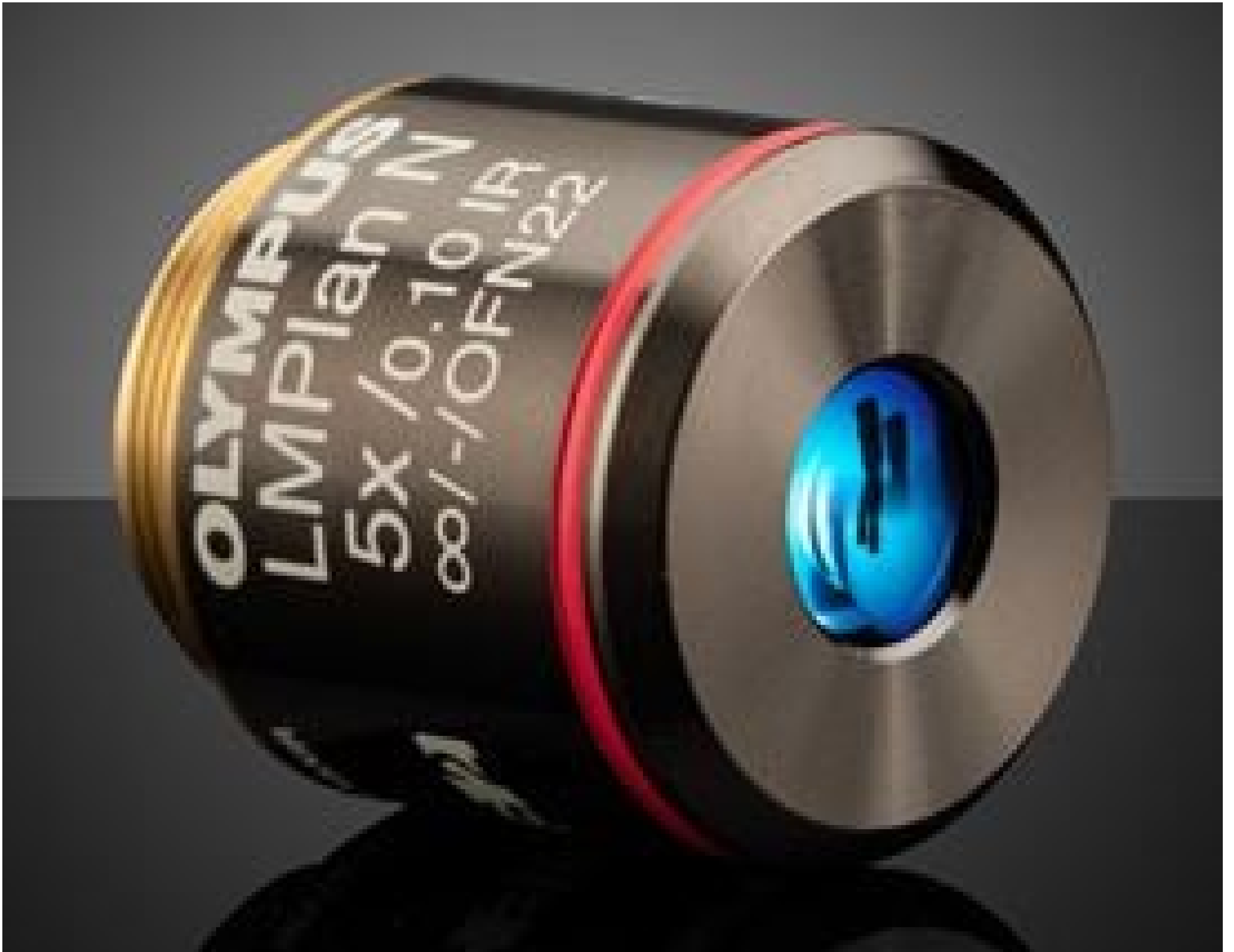
Olympus LMPLN5XIR 5X NIR Objective