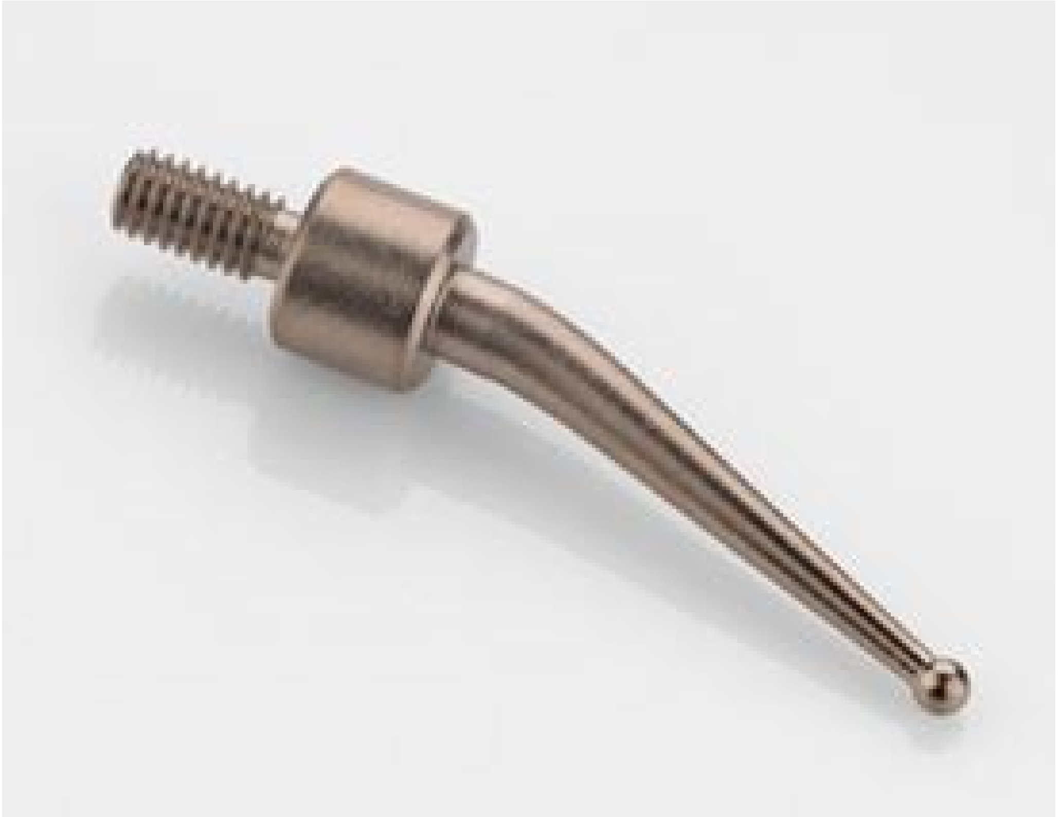
Off-center Attachment Measuring Probe