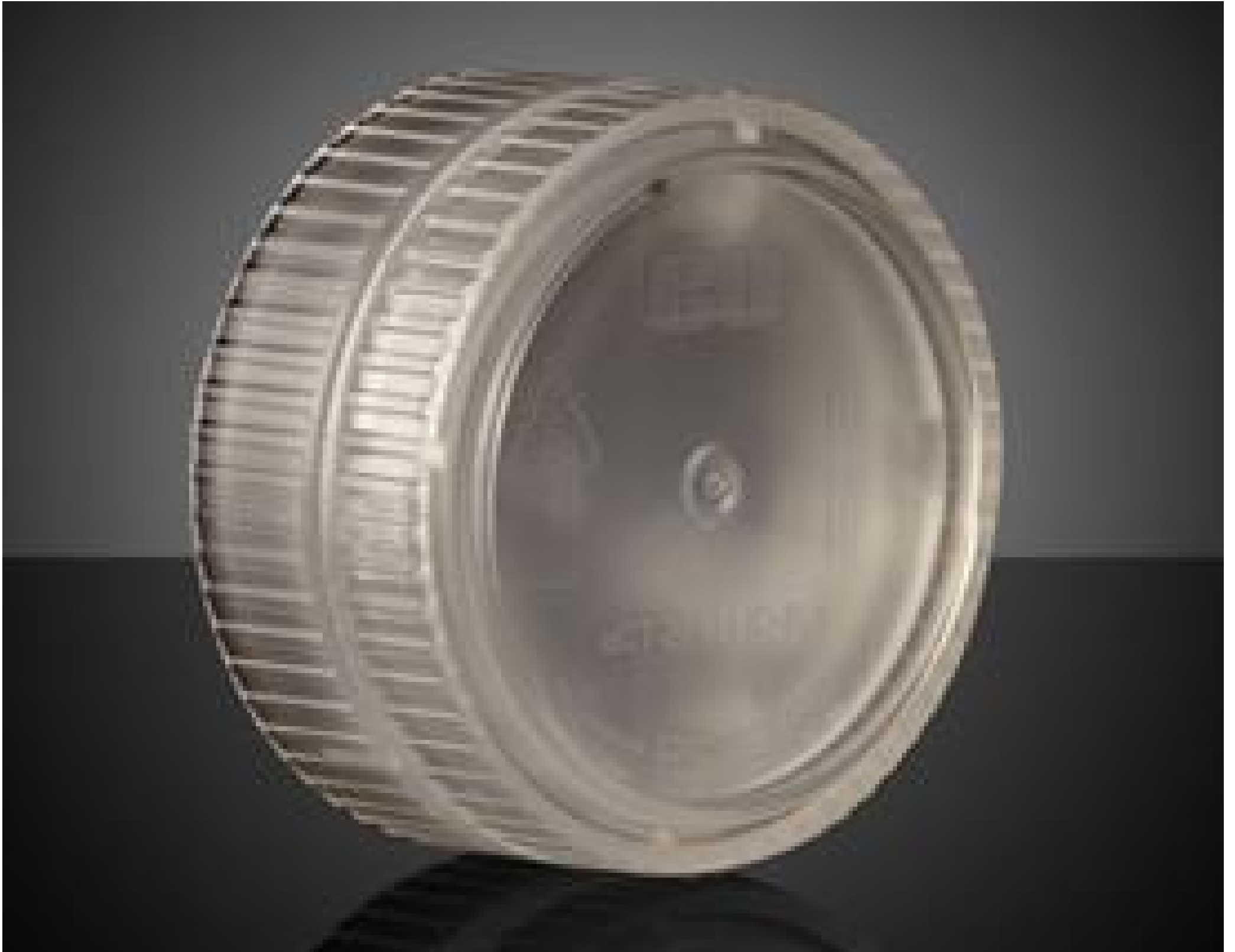
Non-Contact Impact Case for 25.4 Dia. Optics