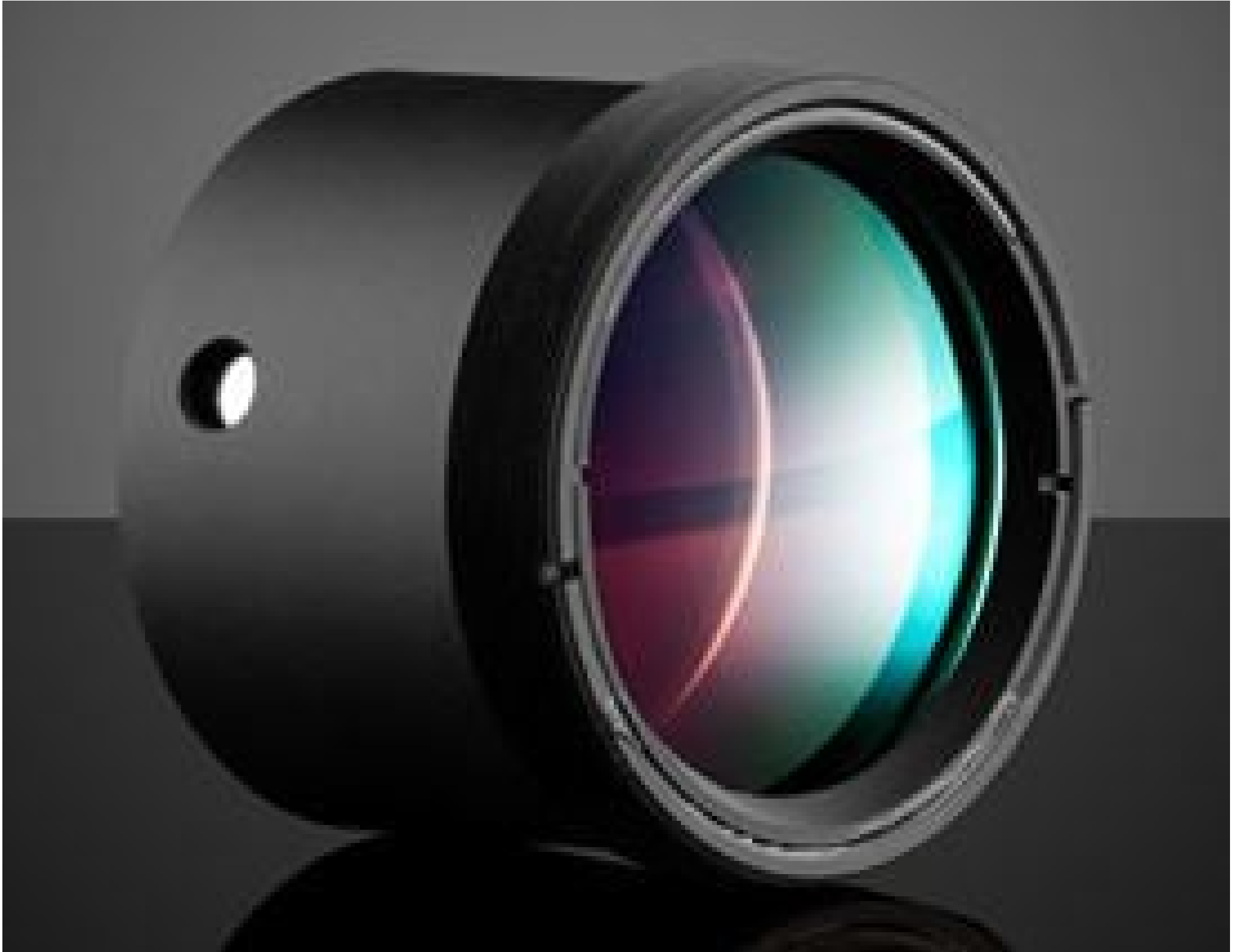
#58-520: Nikon 200mm Tube Lens