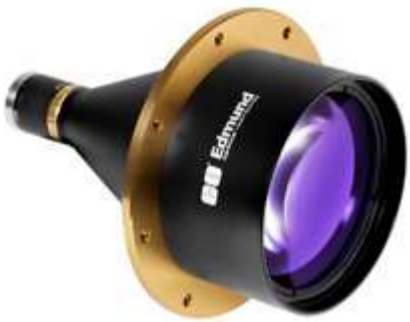
#34-016 - 0.191X, 4/3" C-Mount TitanTL® Telecentric Lens