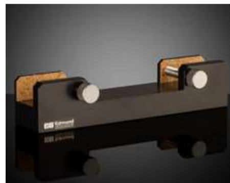
#54-998 - 80mm Sq., Fixed Filter Holder