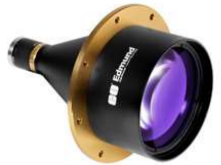
#34-006 - 0.093X, 2/3" C-Mount TitanTL® Telecentric Lens