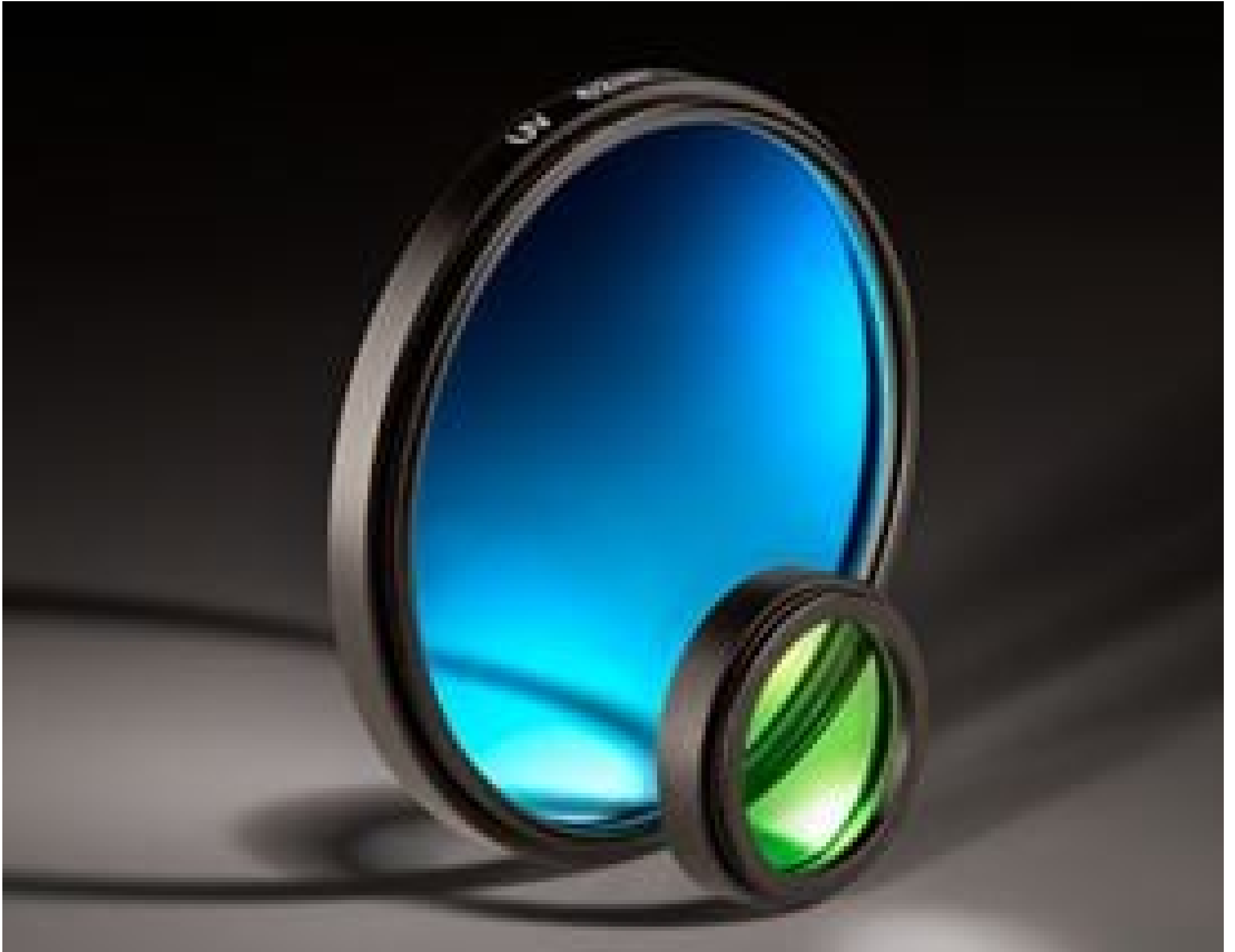
Mounted UV Filters