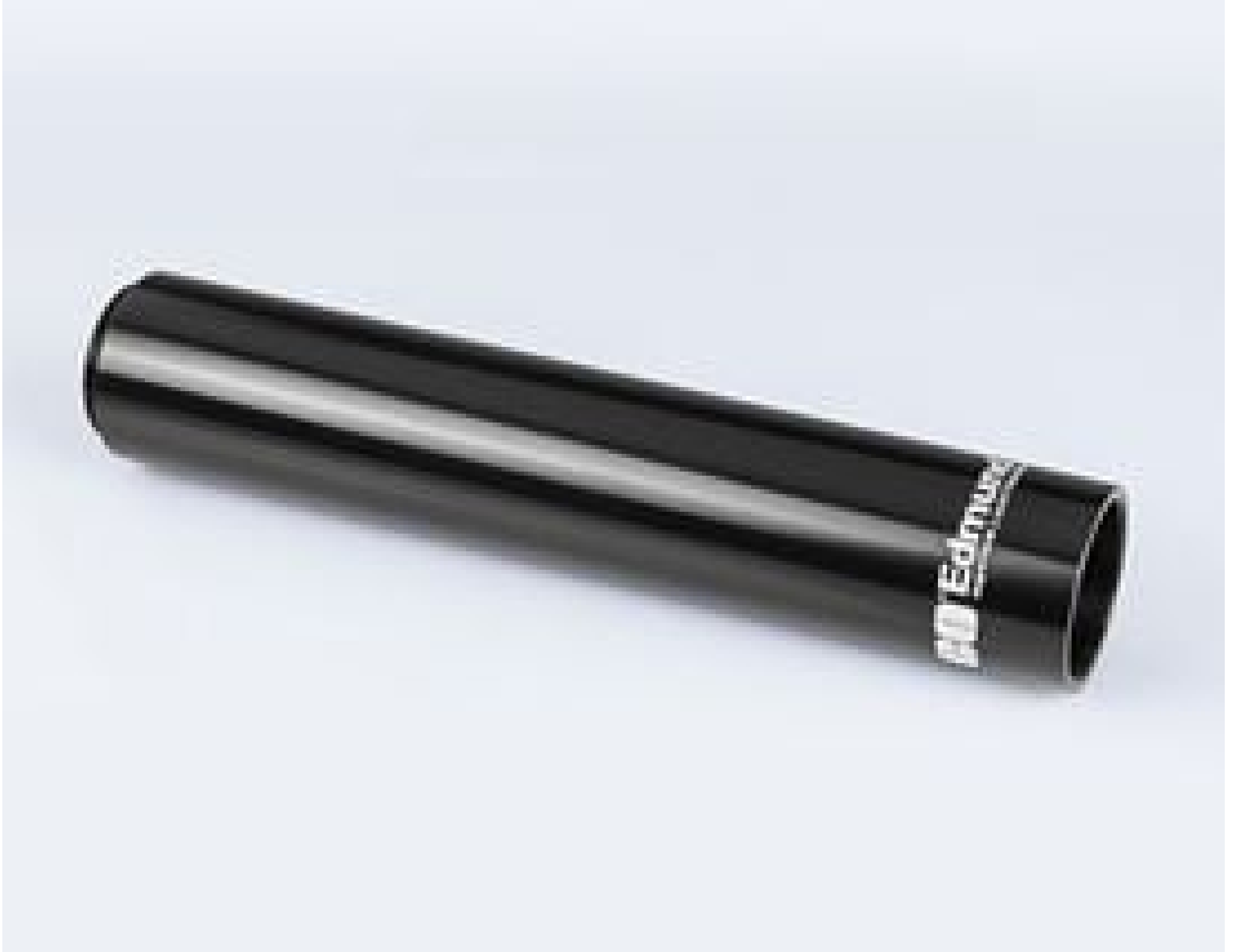
Mitutoyo to C-mount Camera 152.5mm Extension Tube, #56-992