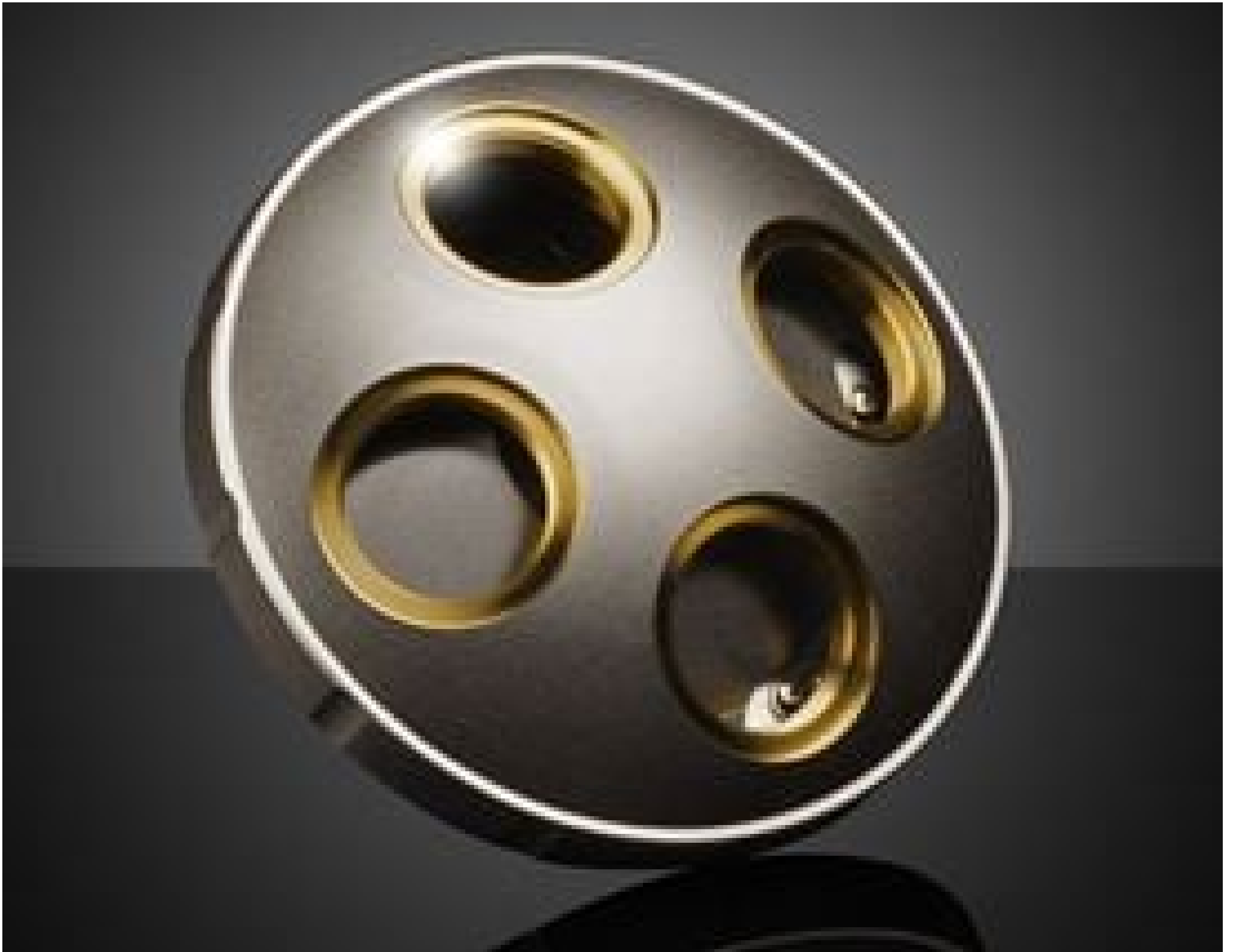
Mitutoyo Manual Turret