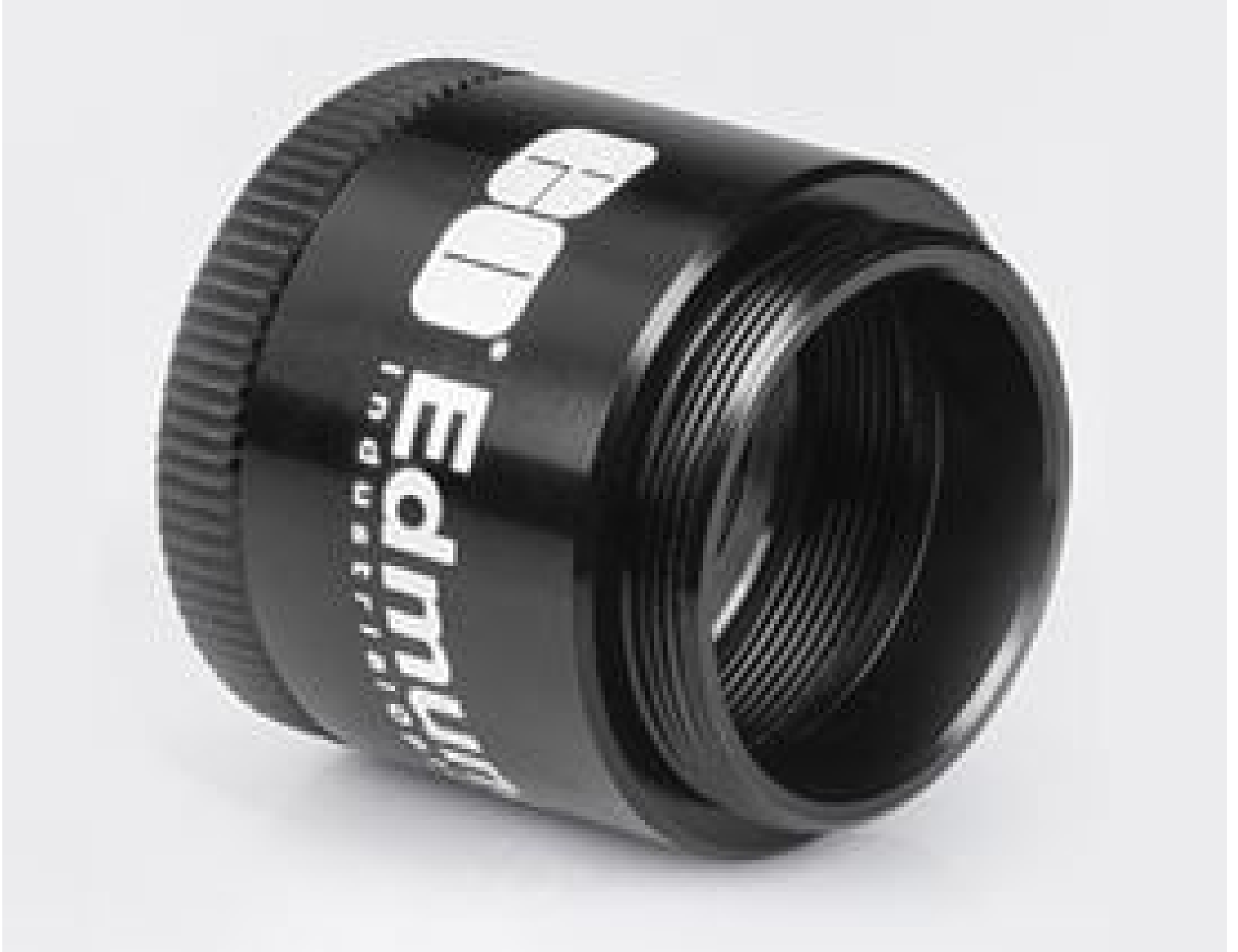
Mitutoyo Filter Holder, #56-993