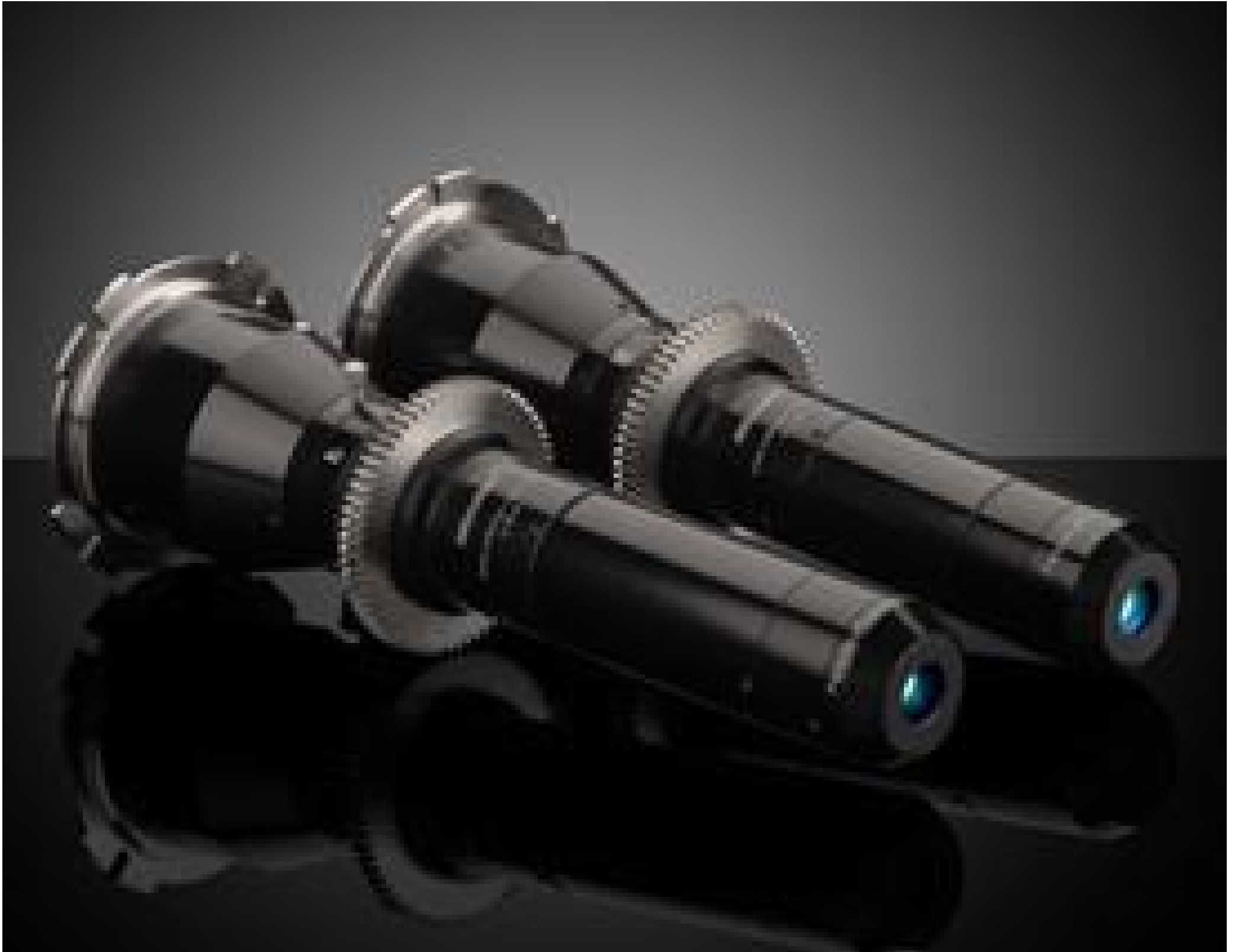
MikroMak™ PetzVex™ Prime Probe Lenses