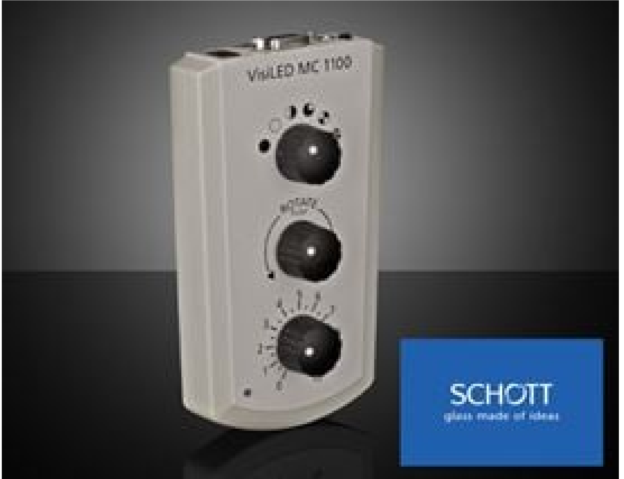
MC 1100, Multifunction Controller, #16-790