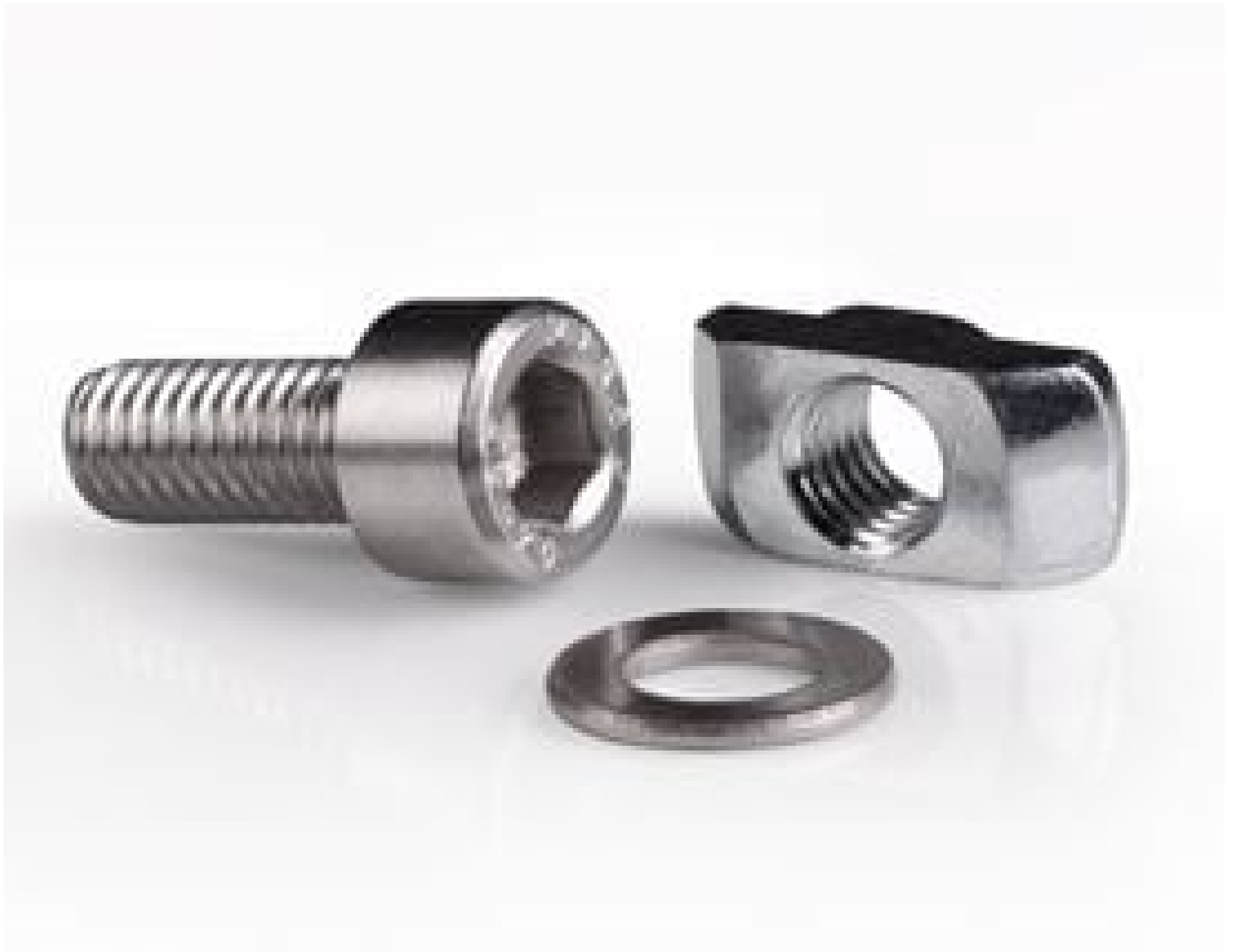
M6 T-Nut (includes M6 x 14 screw), #34-888