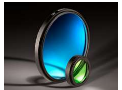
#46-576 - Mounted M30.5 x 0.5 - UV Cut-Off Filter ₹11,401