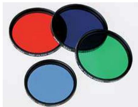
#46-546 - Mounted M30.5 x 0.5 Threaded - Green Filter ₹6,508