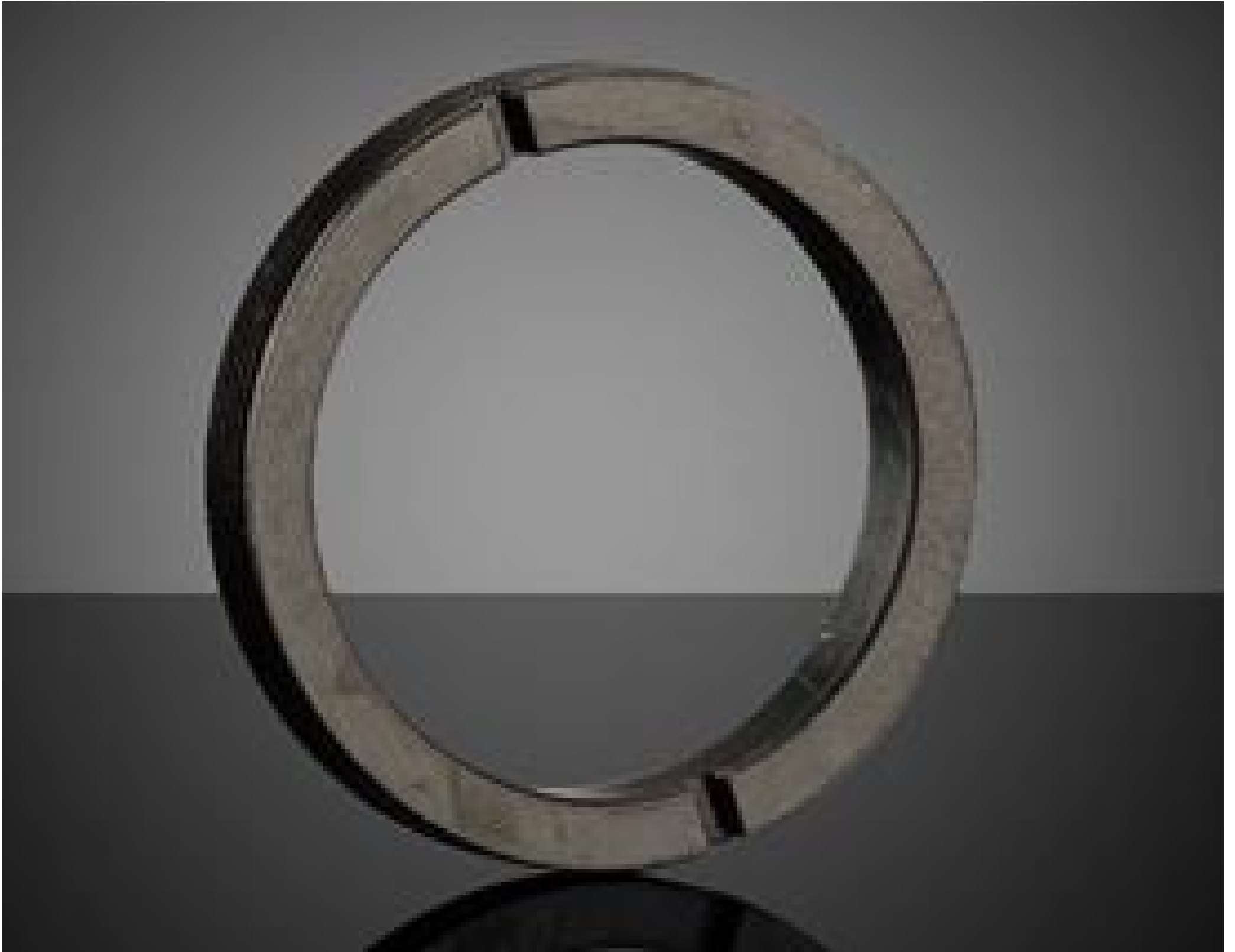
M21 x 0.5 Eyepiece Retainer Ring for #35-689