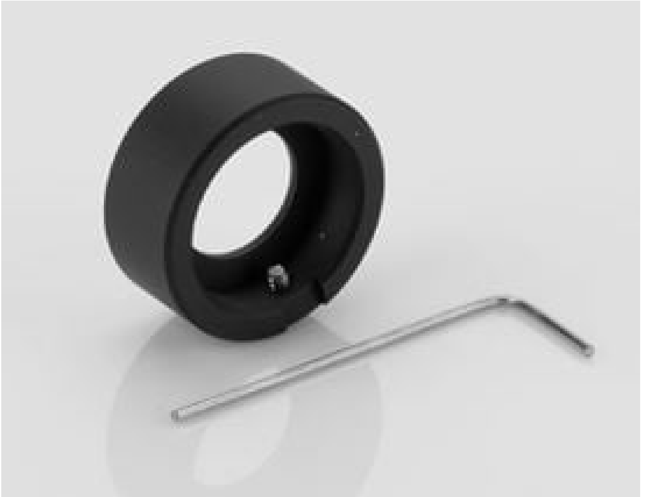
#33-686: Liquid Lens Holder for 50mm Cx Lens