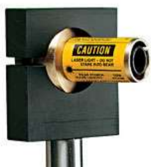
#53-262 - 11mm Dia., Laser Diode Mount ₹12,107