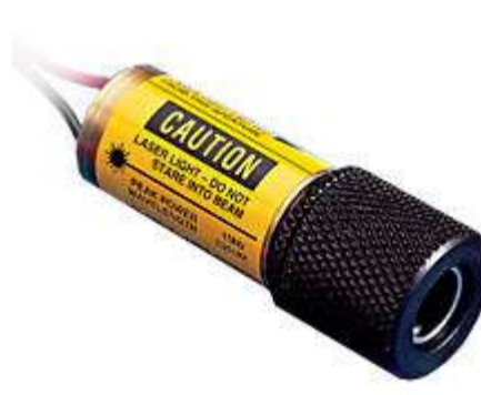
#52-896 - 1.1mW 635nm 30°, VLM™2 Laser Line Focusable ₹31,435