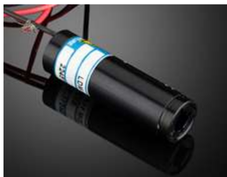
#39-918 - 0.9mW 670nm, Miniature LDM Laser Diode ₹20,072