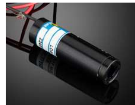
#53-232 - 0.9mW 633nm, Miniature LDM Laser Diode ₹20,072