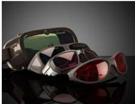
Laser Safety Glasses and Goggles