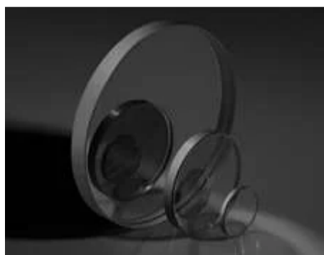
#49-065 - 0.6 OD 25mm Diameter UV-VIS ND Filter ₹13,217