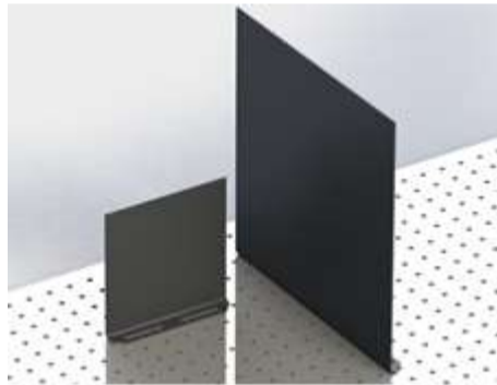
Laser Safety Barriers