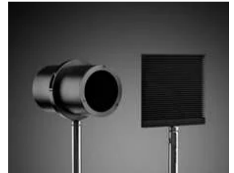
Acktar Blackened Laser Beam Traps and Blocks