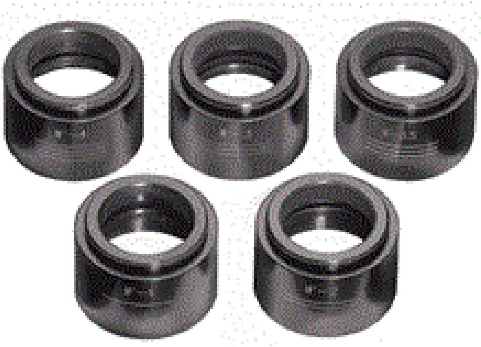
IF-Series Objectives (photo shows IF-1, IF-2, IF-3, IF-3.5, and IF-4), all sold separately