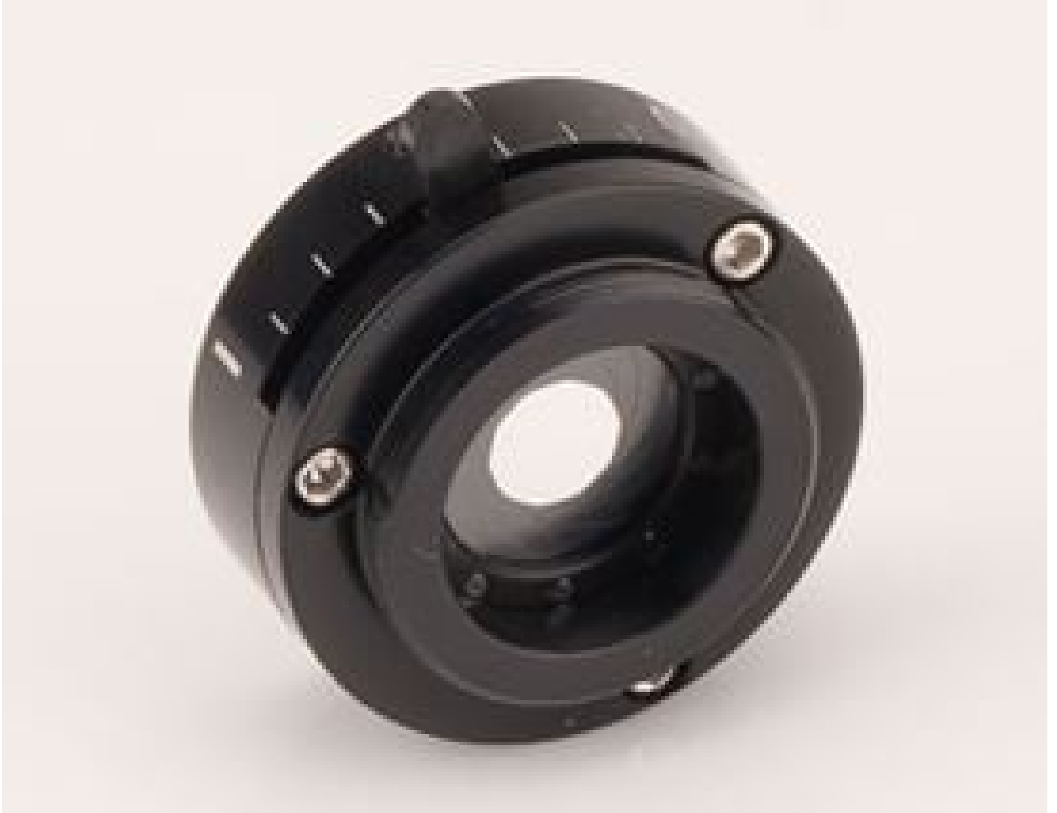
#53-789: KC Iris Diaphragm