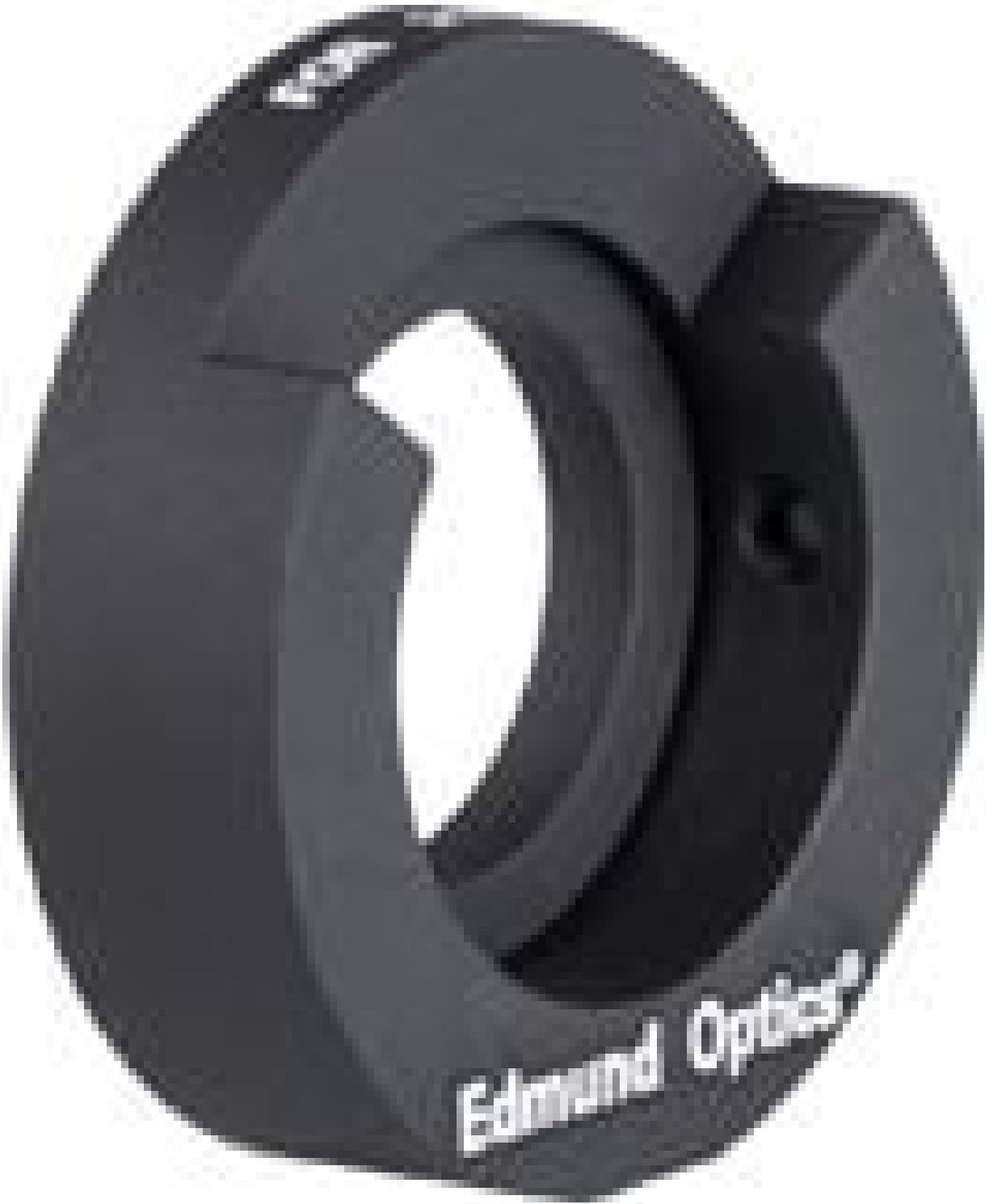
Iris Mount for 21mm Outer Diameter Irises, #54-862