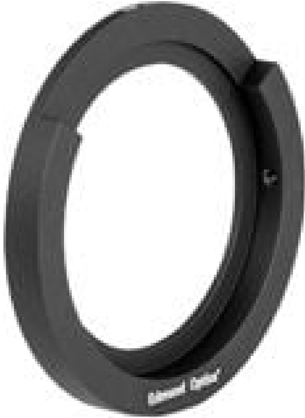
Iris Mount for 70mm Outer Diameter Irises, #53-921