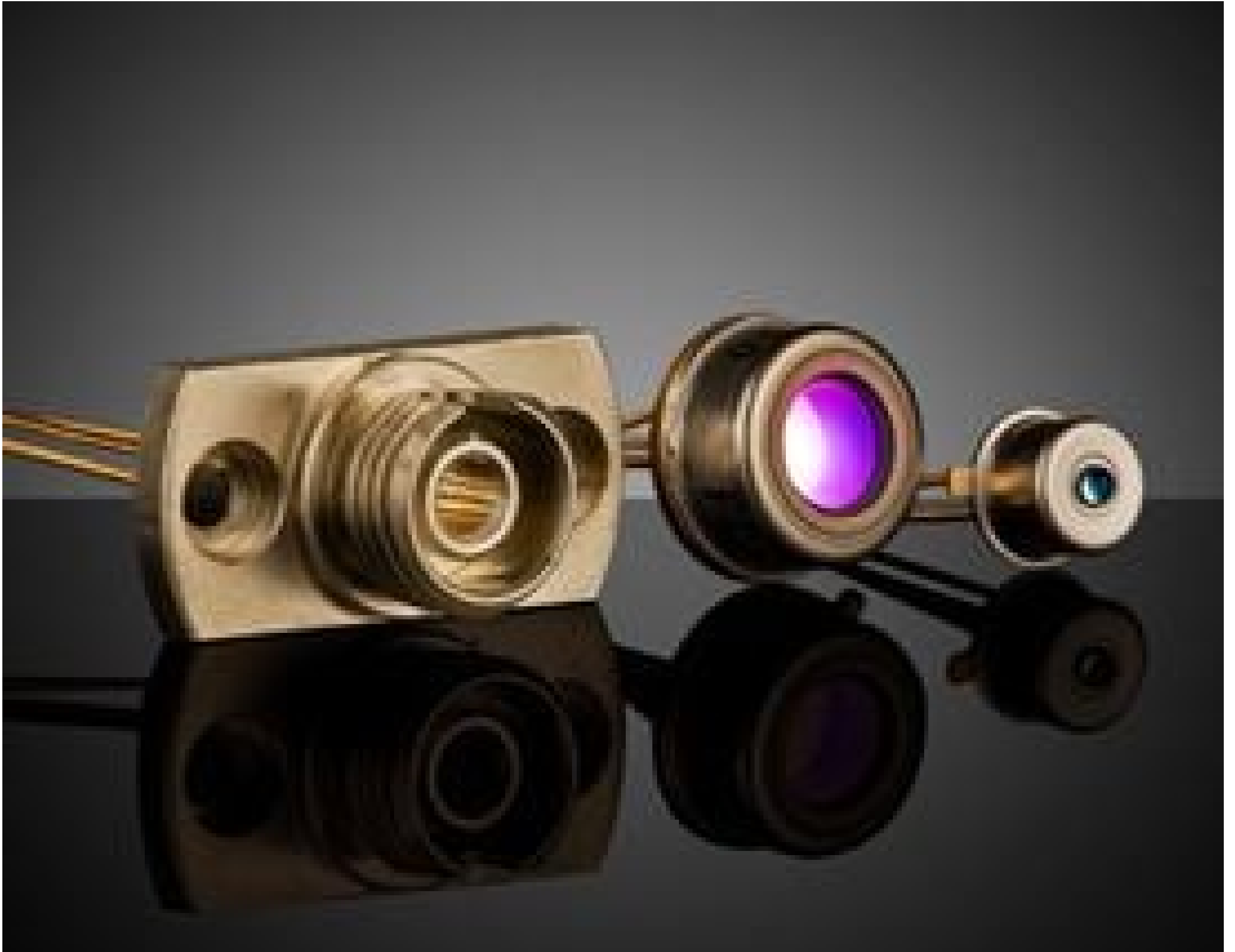
InGaAs Photodiodes (FC Receptacle , TO-5, TO-46)