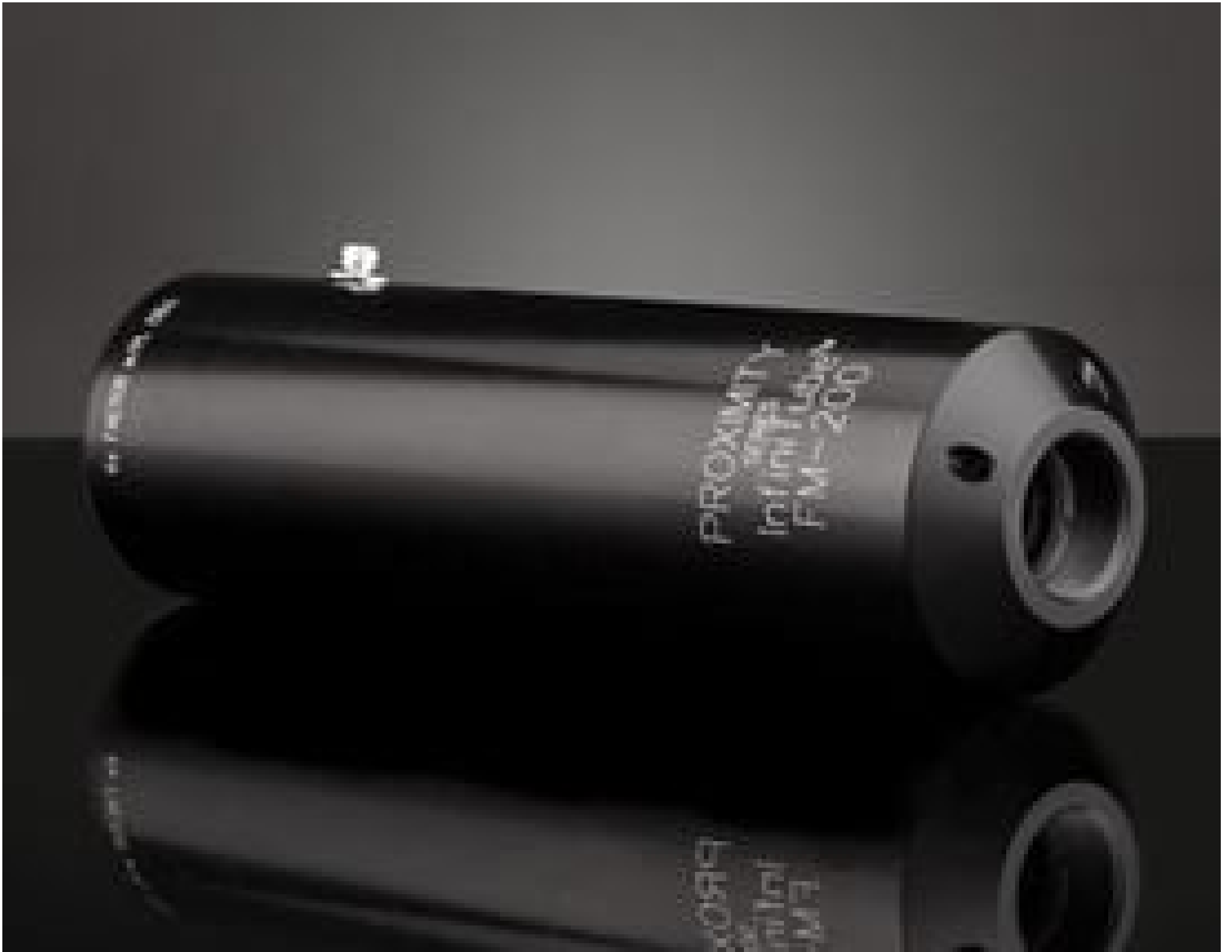
InfiniTube FM-200 (1X), #58-310

See More by Infinity Photo-Optical Company