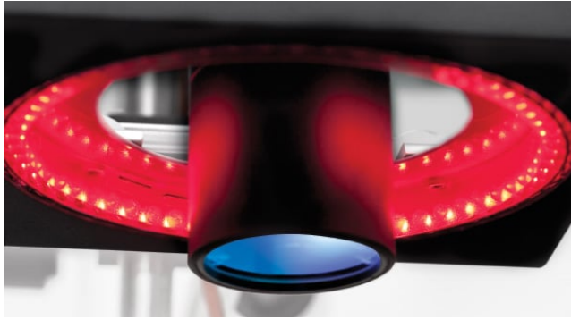
Hypercentric Lens in Borescope Mode