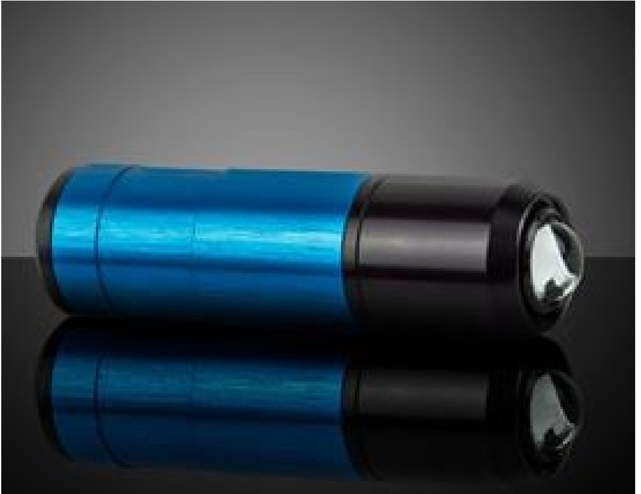
Premier Laser Diode Detector