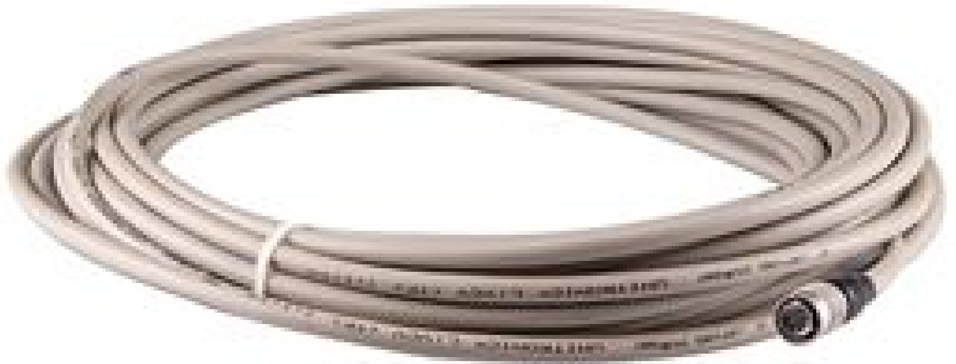
10m GPIO & Power Cable, #88-516