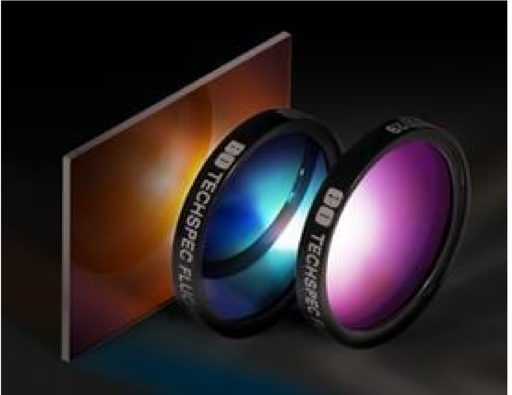
Fluorescence Filter Sets