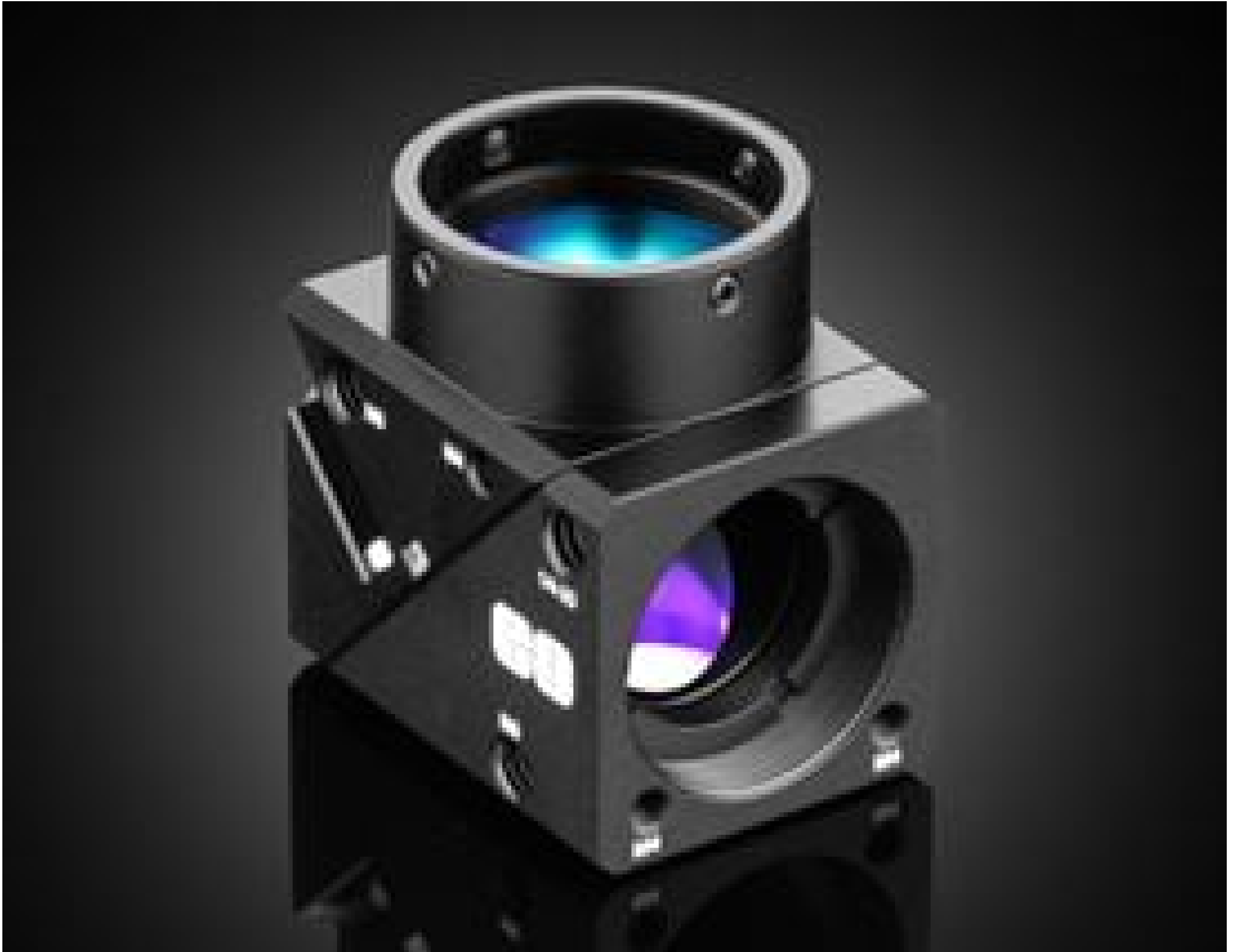
#18-508: Filter Cube Assembly