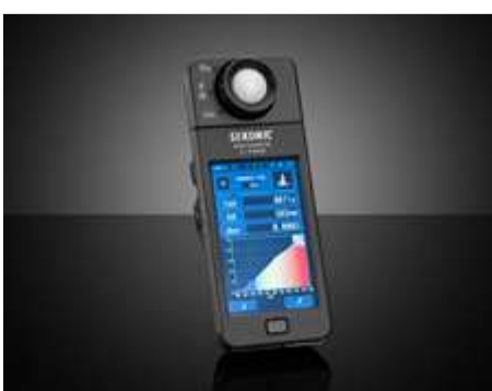
Testing and Detection