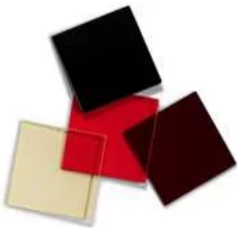
#32-759 - SCHOTT RG-850, 25.4mm Dia., 3mm Thick, Colored Glass Longpass Filter ₹6,558