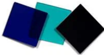
#46-433 - SCHOTT BG38, 25.4mm Dia., 3mm Thick, Colored Glass Bandpass Filter ₹6,457