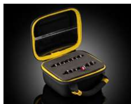
Hard Coated OD 4.0 Bandpass Filter Kits